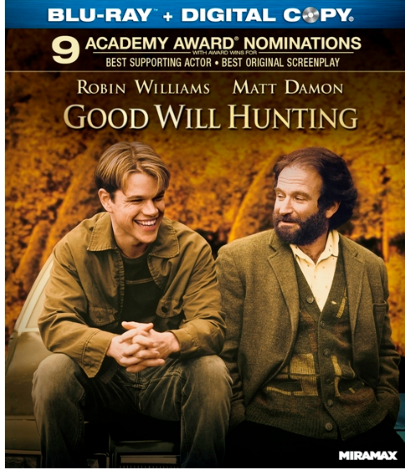
Good Will Hunting will be released on Blu-ray on August 30th, 2011

We'll get to the list of special features, some of which are quite impressive, but if you're wondering about the transfers, Lionsgate (who handled the three single-word titles) can be a bit frustrating when it comes to their catalog titles. They often look good, not great. These are not what some might expect from special editions or anniversary releases. They're pure imports — taking what you probably already own and merely transferring it to a new format. If you already bought any of these four films and don't feel the need to upgrade your entire collection, don't bother. But if you've put off buying your favorite of the quartet, here's what you'll find: