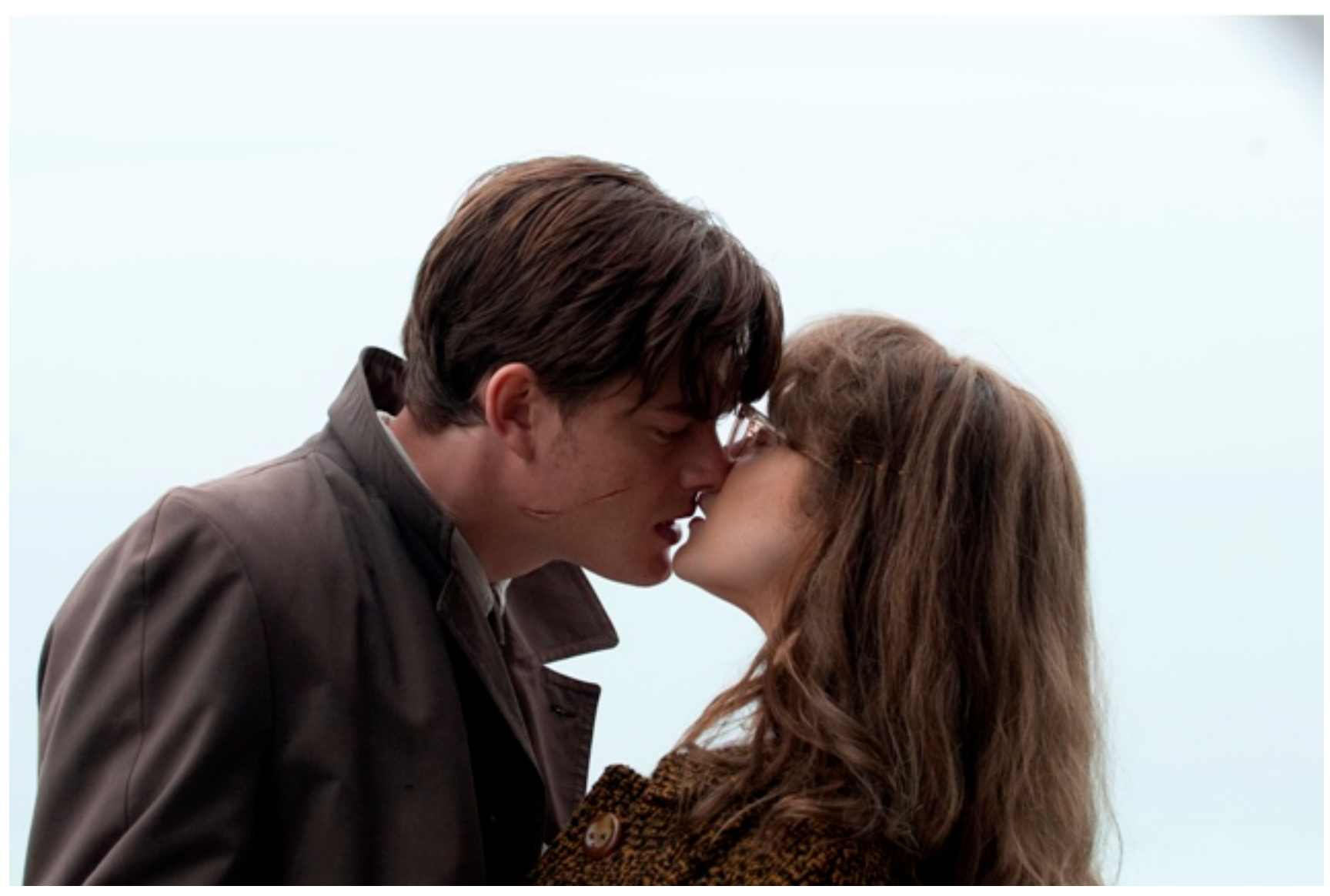
Brighton Rock

Published on HollywoodChicago.com (http://www.hollywoodchicago.com)