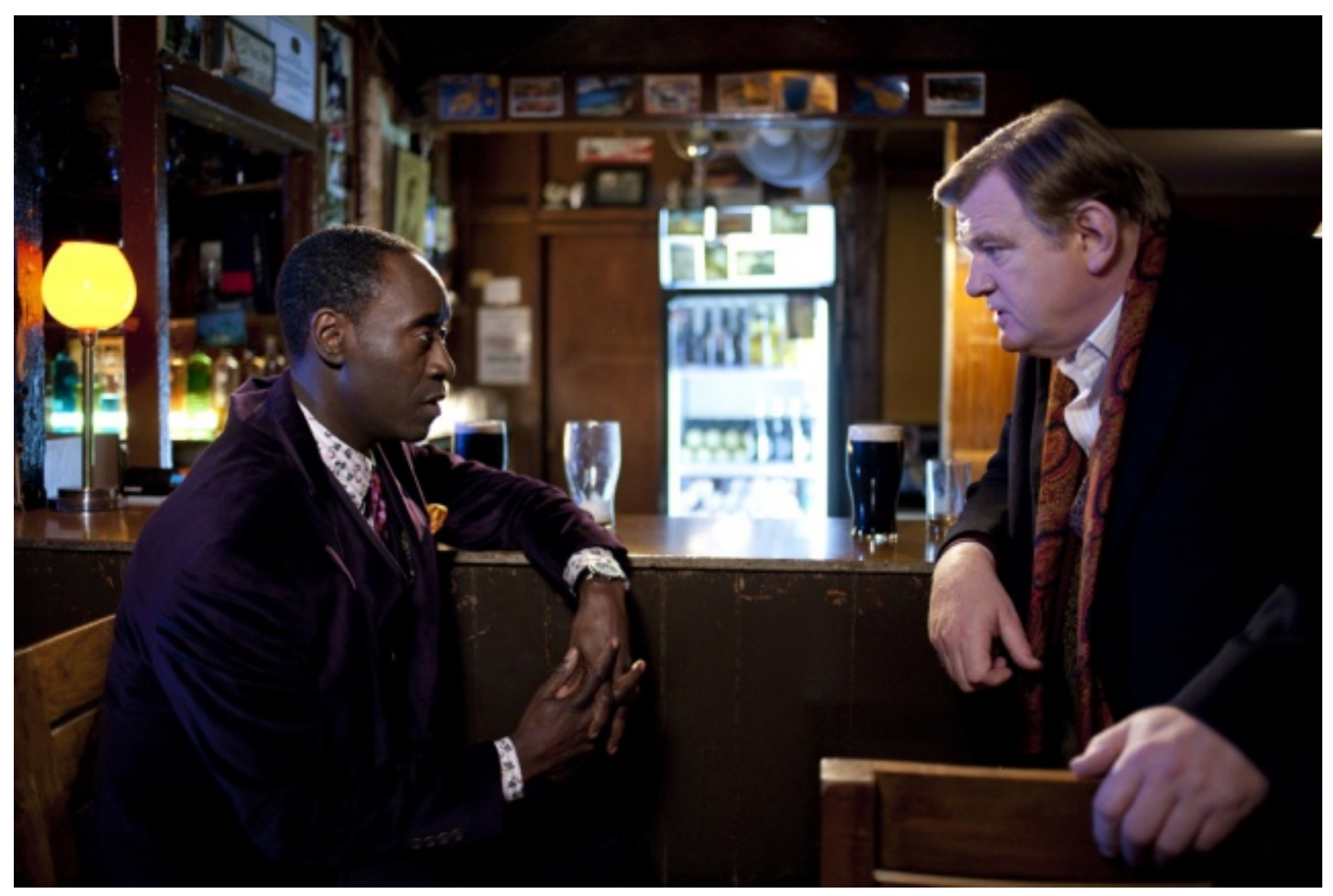
The Guard

Published on HollywoodChicago.com (http://www.hollywoodchicago.com)