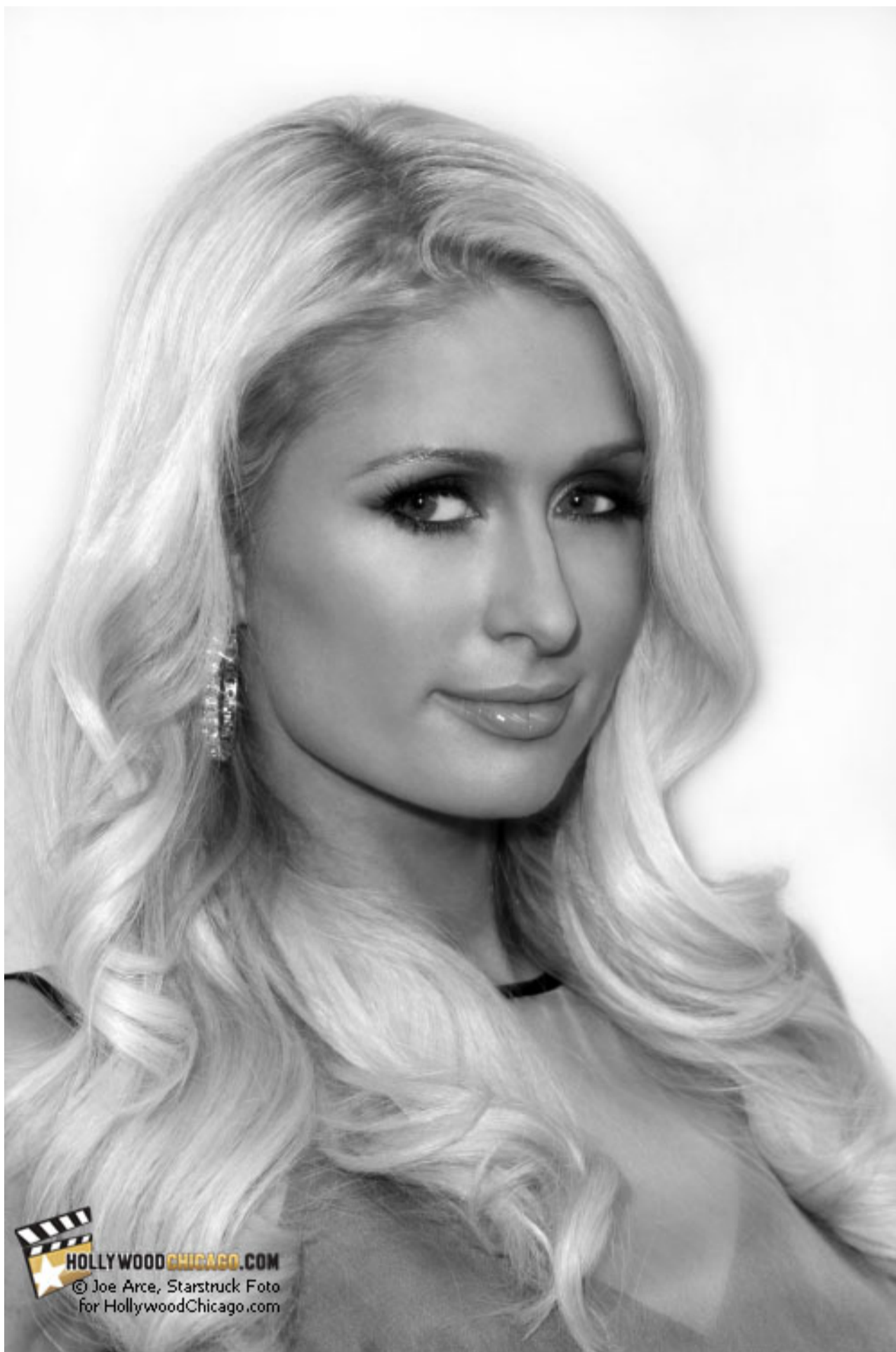
Paris Hilton in Chicago, June 15, 2011, Promoting 'The World According to Paris'

HollywoodChicago.com: How would you describe your new show, 'The World According to Paris'?