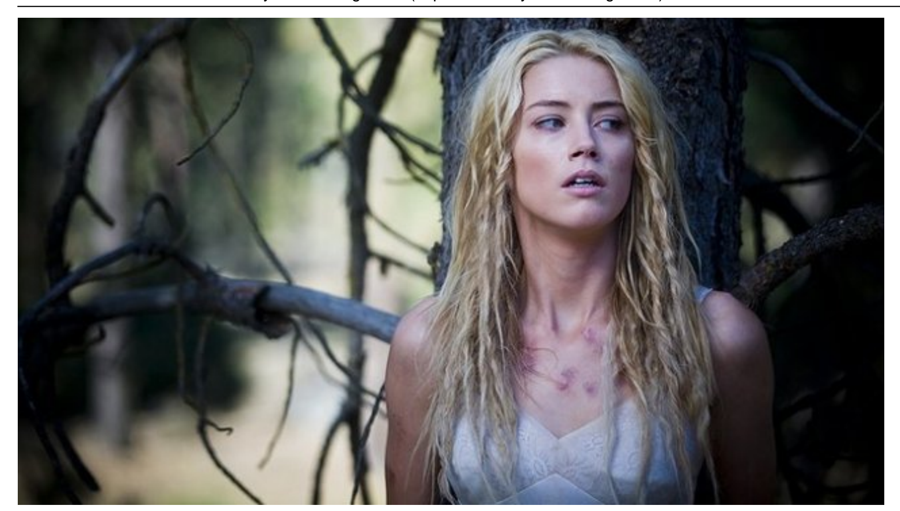
The Ward