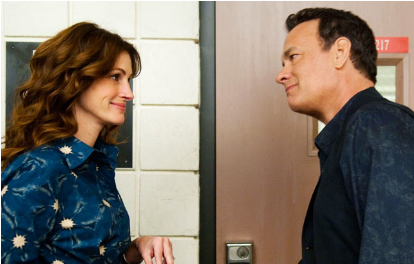
To Her With Love: Julia Roberts (Mrs. Tainot) and Tom Hanks as the Title Character ‘Larry Crowne’