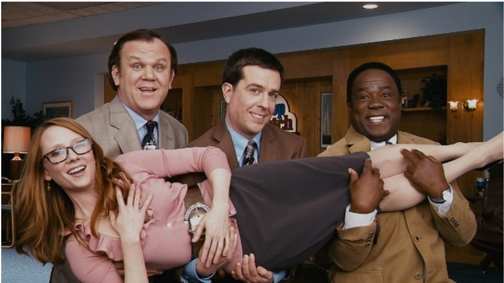
Cedar Rapids was released on Blu-ray and DVD on June 21st, 2011

Helms plays a variation on the stuck-up characters he’s been known for in “The Hangover” and “The Office” but with a bit more heart and naivete. Tim Lippe is a sweet guy but almost uncomfortably so. He doesn’t drink, doesn’t swear, doesn’t tell dirty jokes, and certainly doesn’t sleep around or do drugs. All of that will change in one crazy trip to “Cedar Rapids.” Playing a Midwestern business trip to Iowa as if it is a crazy innocence-busting weekend in Tijuana was an undeniably clever idea. Poor Tim has been sheltered. That’s about to change. And in Cedar Rapids of all places.