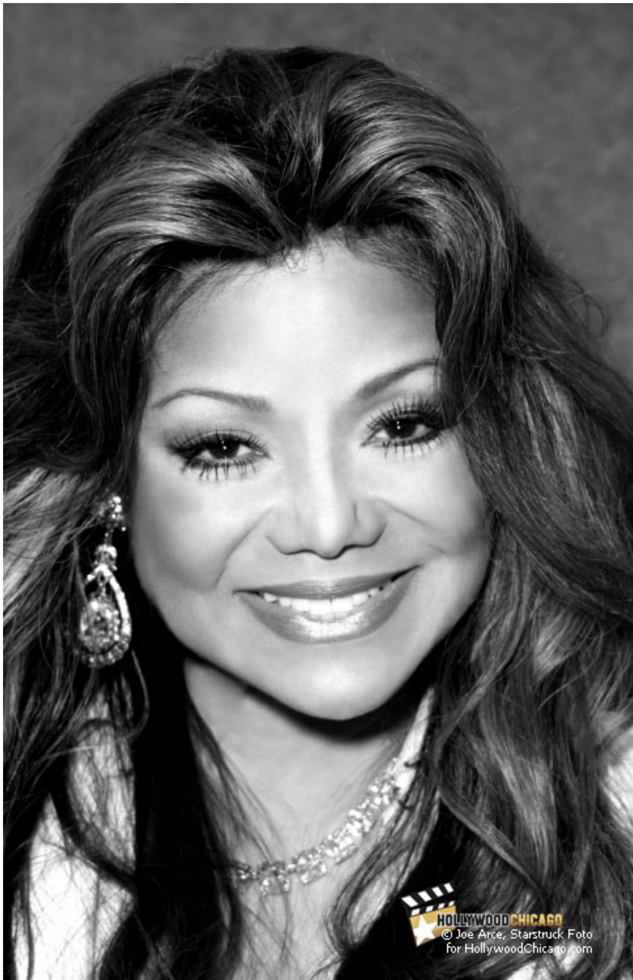
La Toya Jackson at Barnes &amp; Noble Clybourn, Chicago, June 24th, 2011