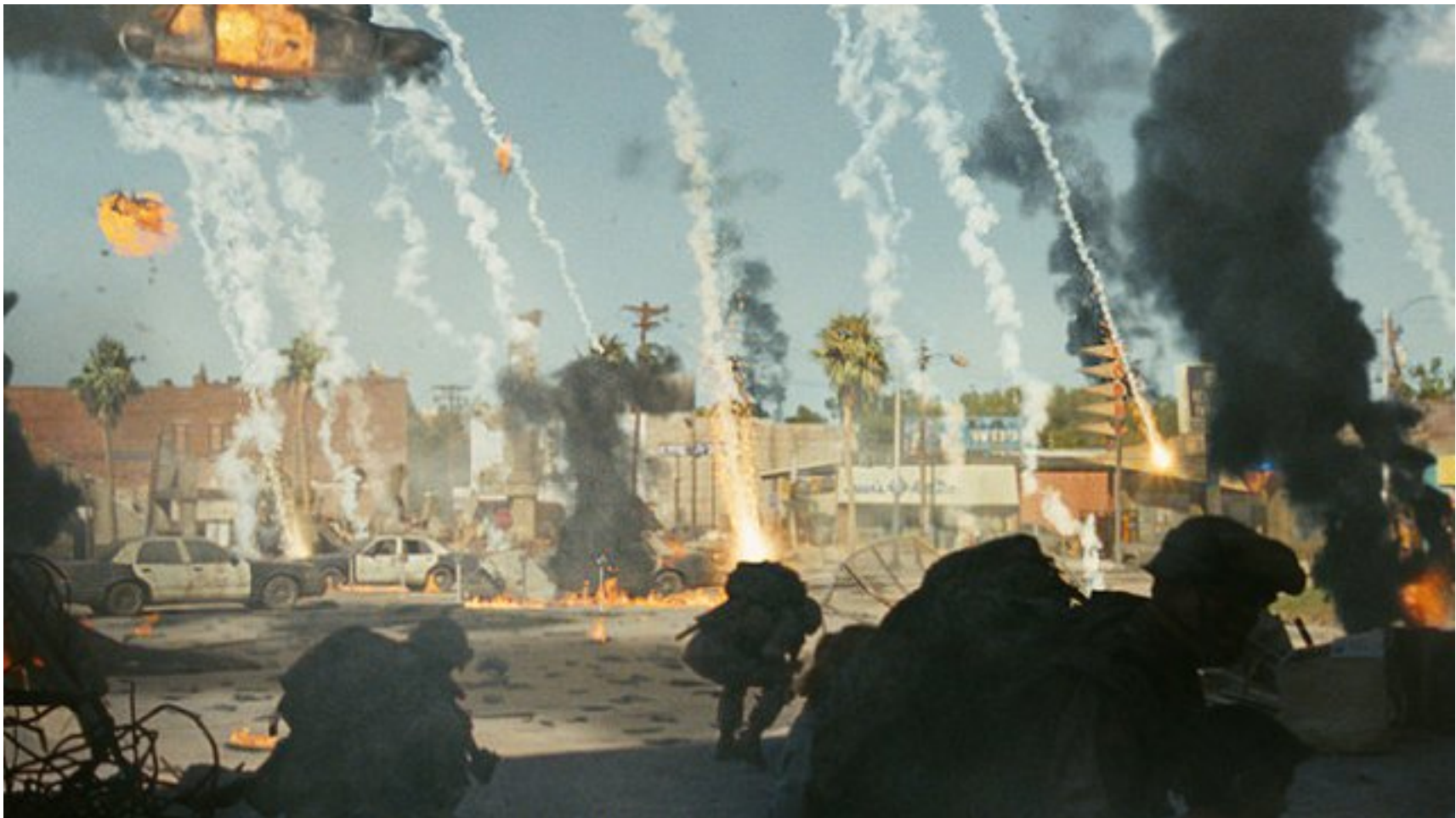
Battle Los Angeles