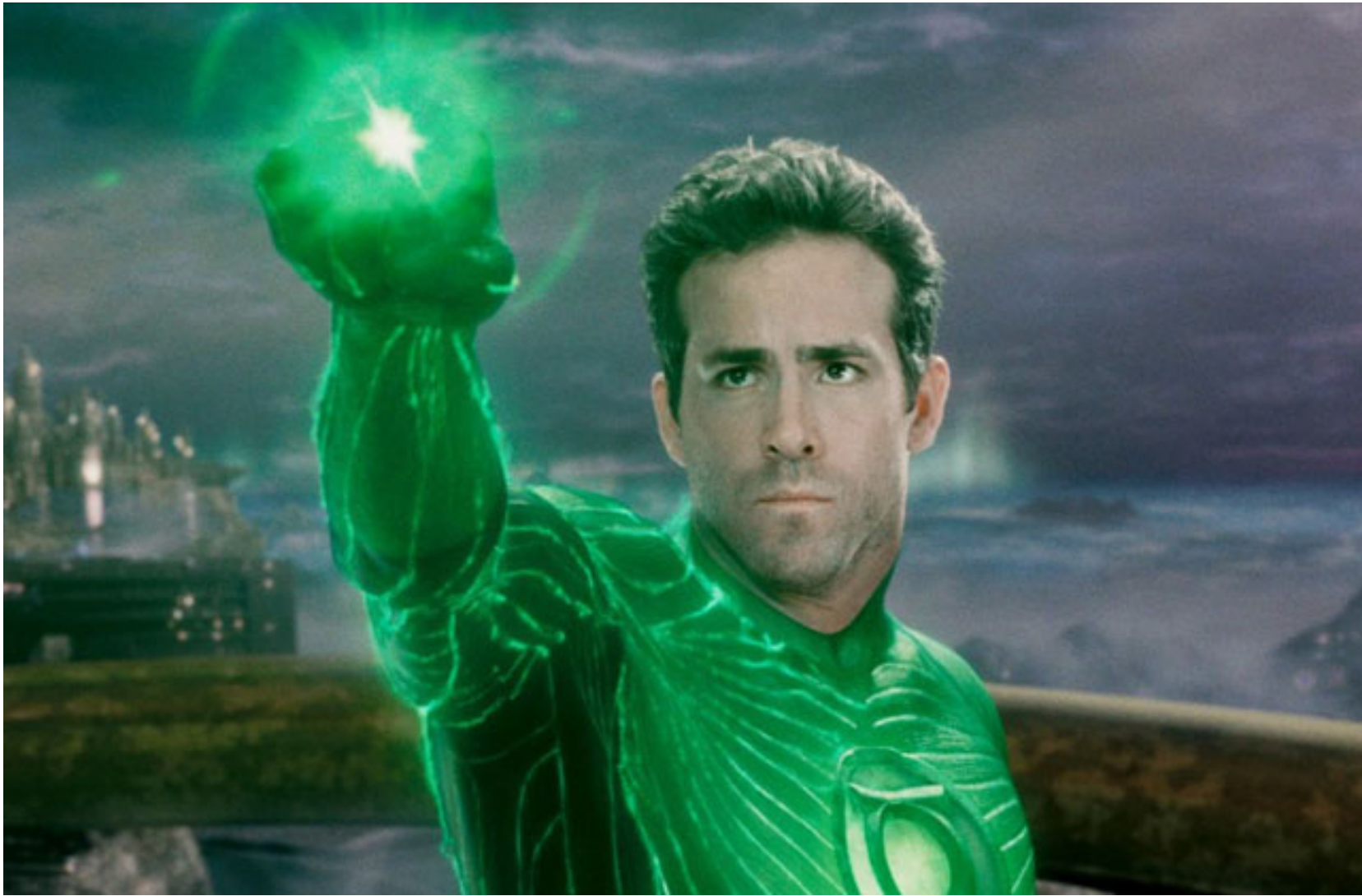
In Brightest Day...: Hal Jordan (Ryan Reynolds) is ‘Green Lantern’