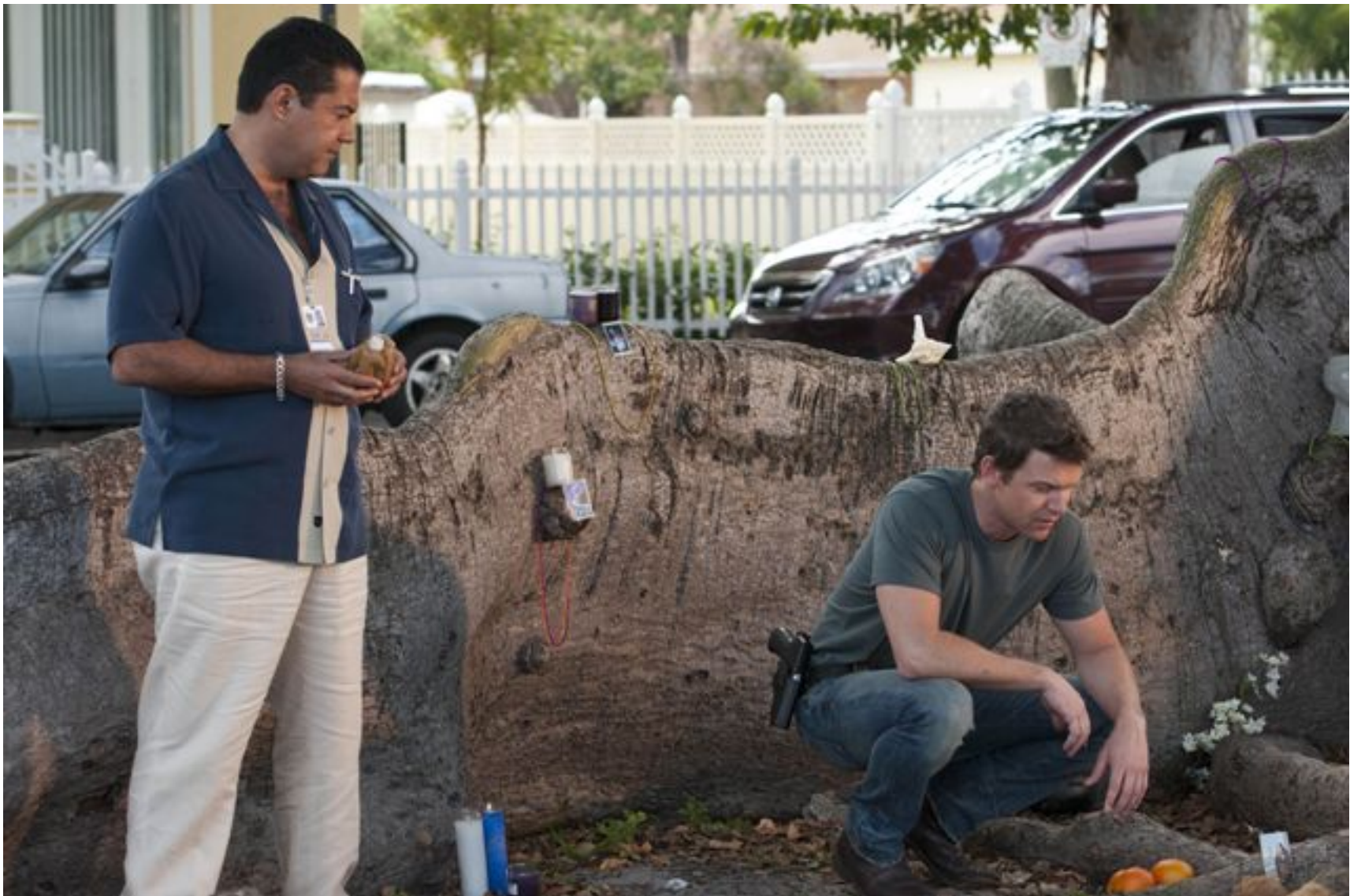
The Glades