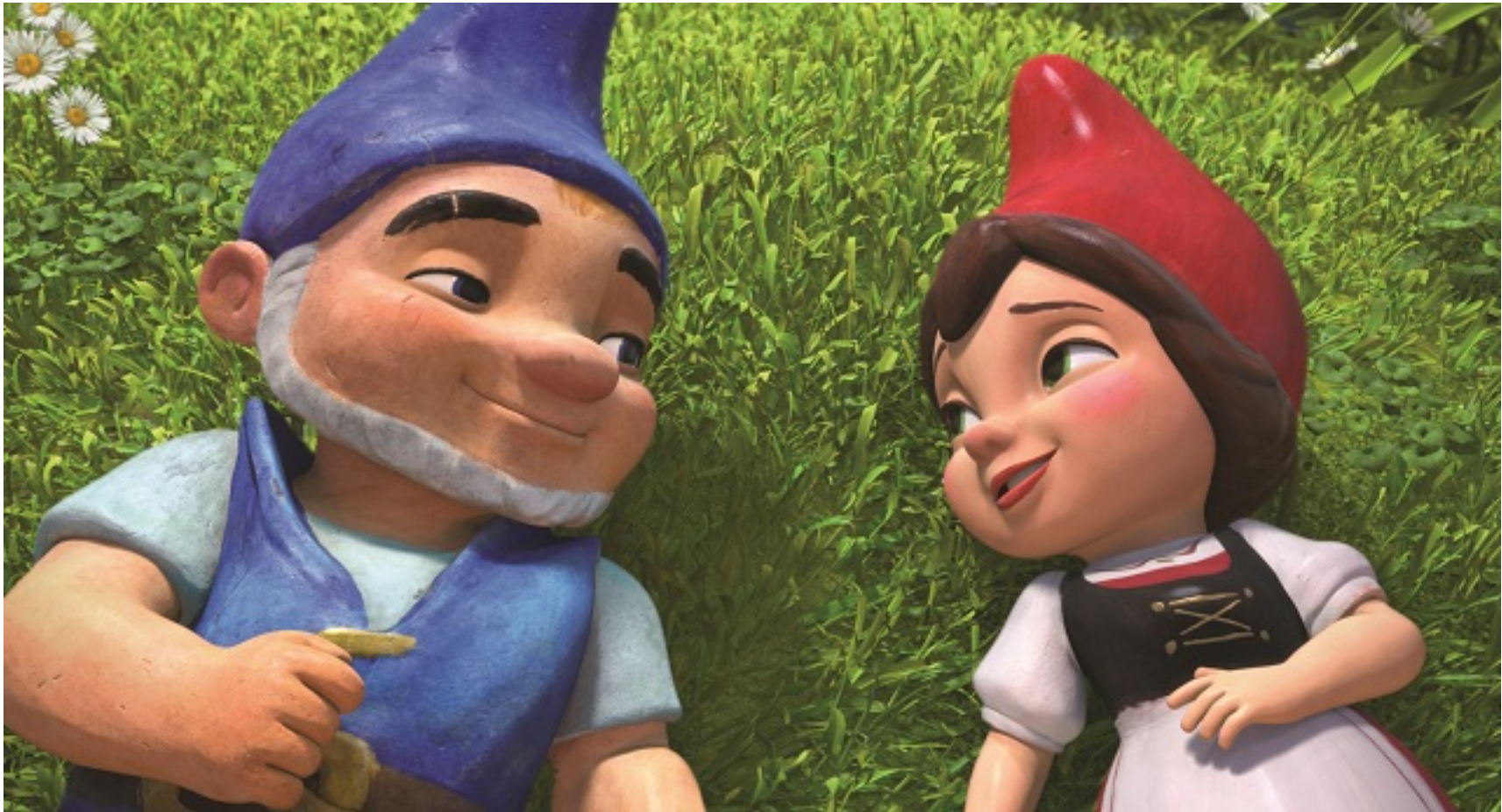
Gnomeo & Juliet was released on Blu-Ray and DVD on May 24, 2011

The concept of “Gnomeo & Juliet” is simple enough. It reimagines “Romeo and Juliet” with lawn gnomes and, of course, a bit less bloodletting. The tale of forbidden love is accompanied by both new songs by John and some of his more peppy hits like “Saturday Night’s Alright For Fighting,” “Don’t Go Breaking My Heart,” and “Your Song.” New tracks on the soundtrack feature John dueting with Lady Gaga and Nelly Furtado. The star power is undeniable but the melding of Elton John’s music with family fare doesn’t quite take.