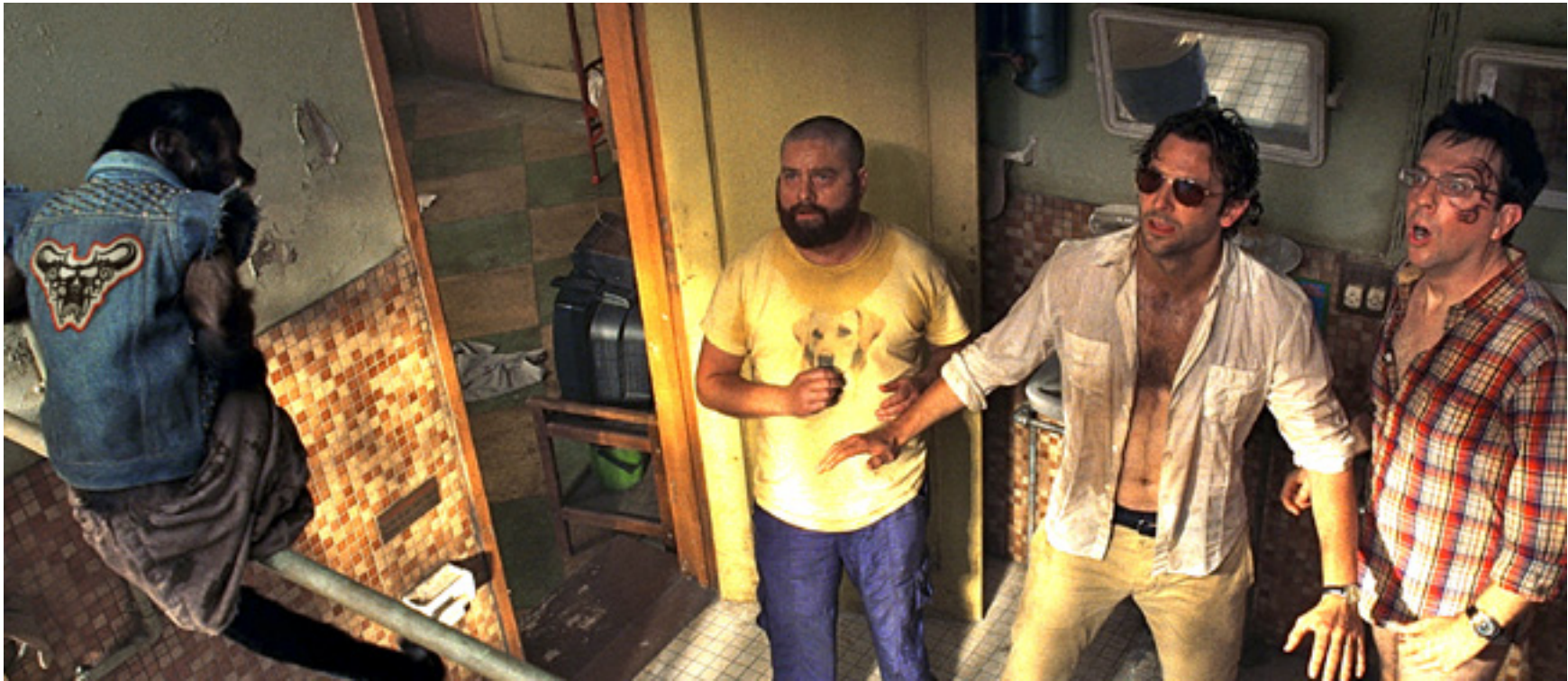
Left to right: Zach Galifianakis, Bradley Cooper and Ed Helms in “The Hangover Part II”.