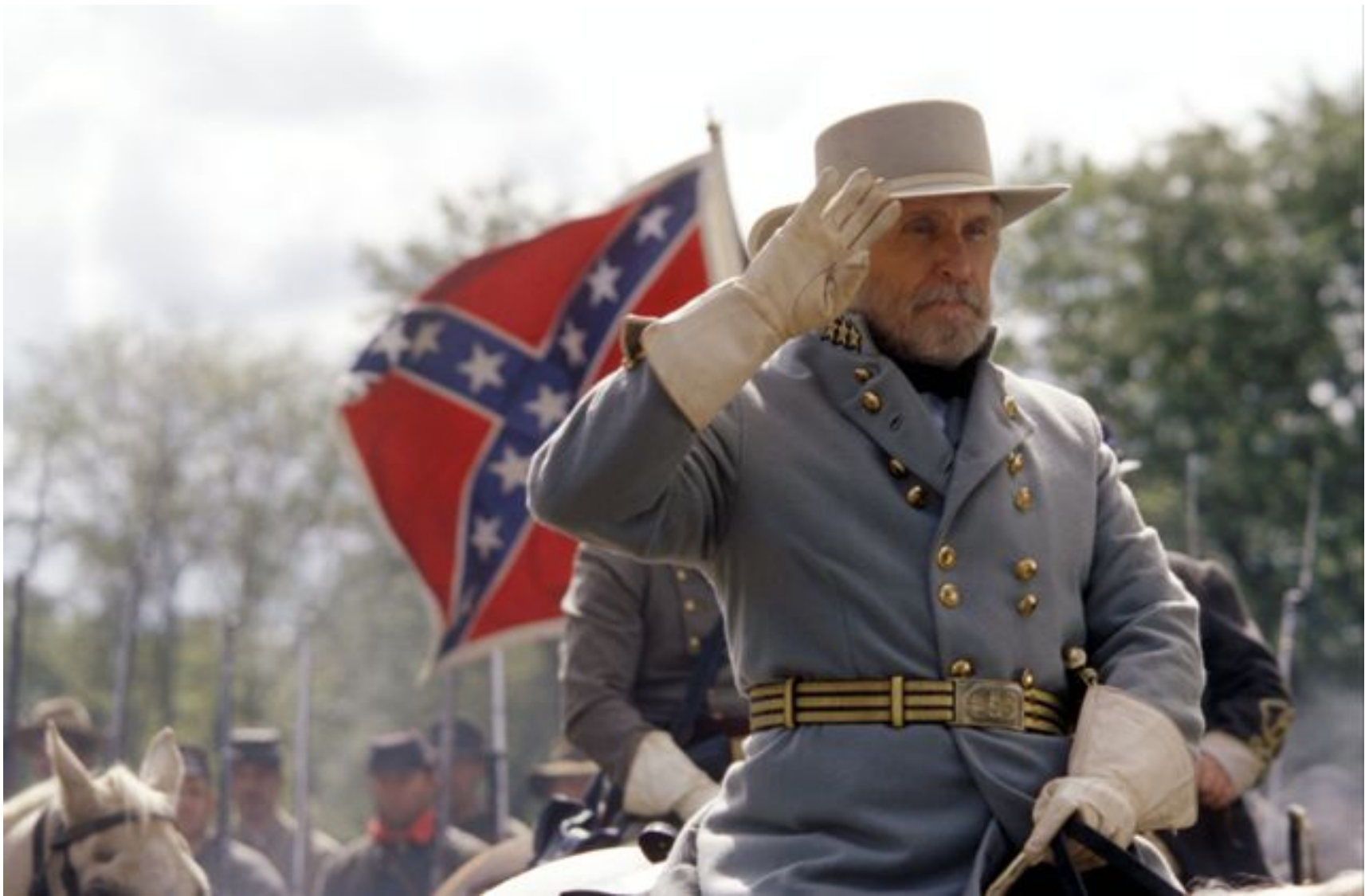
Gettysburg and Gods and Generals were released on Blu-ray on May 24th, 2011

As for the rest of you, the films are good but not great. They both have very strong casts including legends like Robert DuVall and Martin Sheen along with underrated actors like Tom Berenger, Jeff Daniels, and Stephen Lang. And one has to admire the commitment inherent in both projects. These are epic films not just in length but in scope and effort as well.