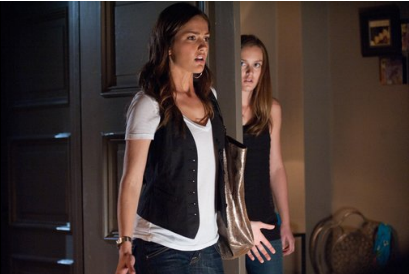
The Roommate was released on Blu-Ray and DVD on May 17, 2011

Seriously, one could study this film and still not figure out why it fails so completely. It has a premise that sounds like B-movie gold (one hot chick becomes obsessed with another) and it has a reasonably talented crew of young stars, most of which have proven they can deliver at least somewhat with notable TV roles. But the first hour drags so much that by the time kittens are going into dryers and teachers are being assaulted, “The Roommate” will have lost the interest of most viewers.