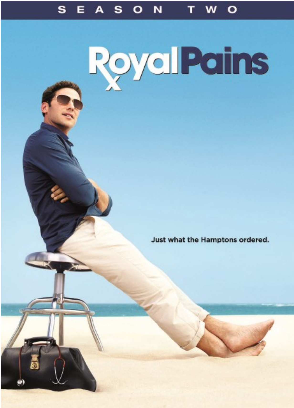
Royal Pains: Season Two was released on DVD on May 17, 2011

The DVD set for the first season of “Covert Affairs” includes all eleven episodes spread out over three standard discs, each with their own slim case. Cast & Crew Commentaries appear on the pilot, 7th episode (“Communication Breakdown”), and season finale (“When the Levee Breaks”). Other interesting supplemental material include deleted scenes, a gag reel, “Welcome to the Farm,” “Blind Insight,” “Set Tour,” and a PSA called “Celebrate the ADA.”