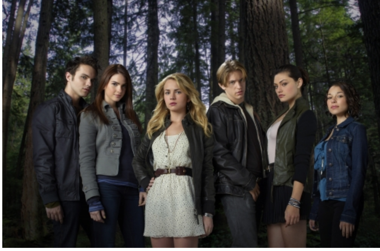
The Secret Circle