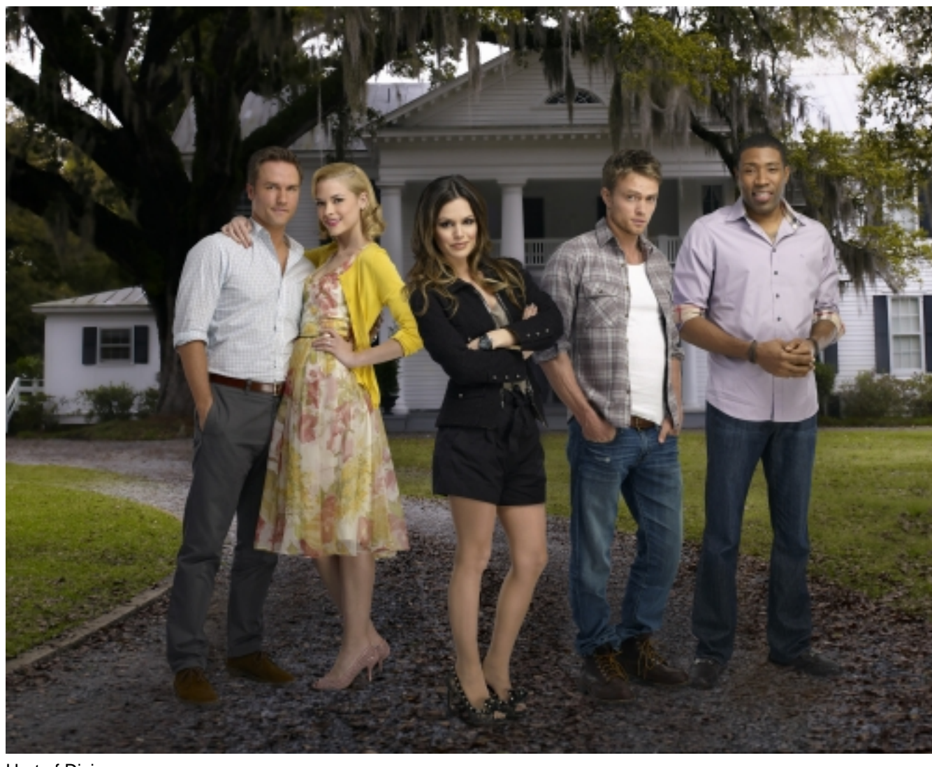
Hart of Dixie