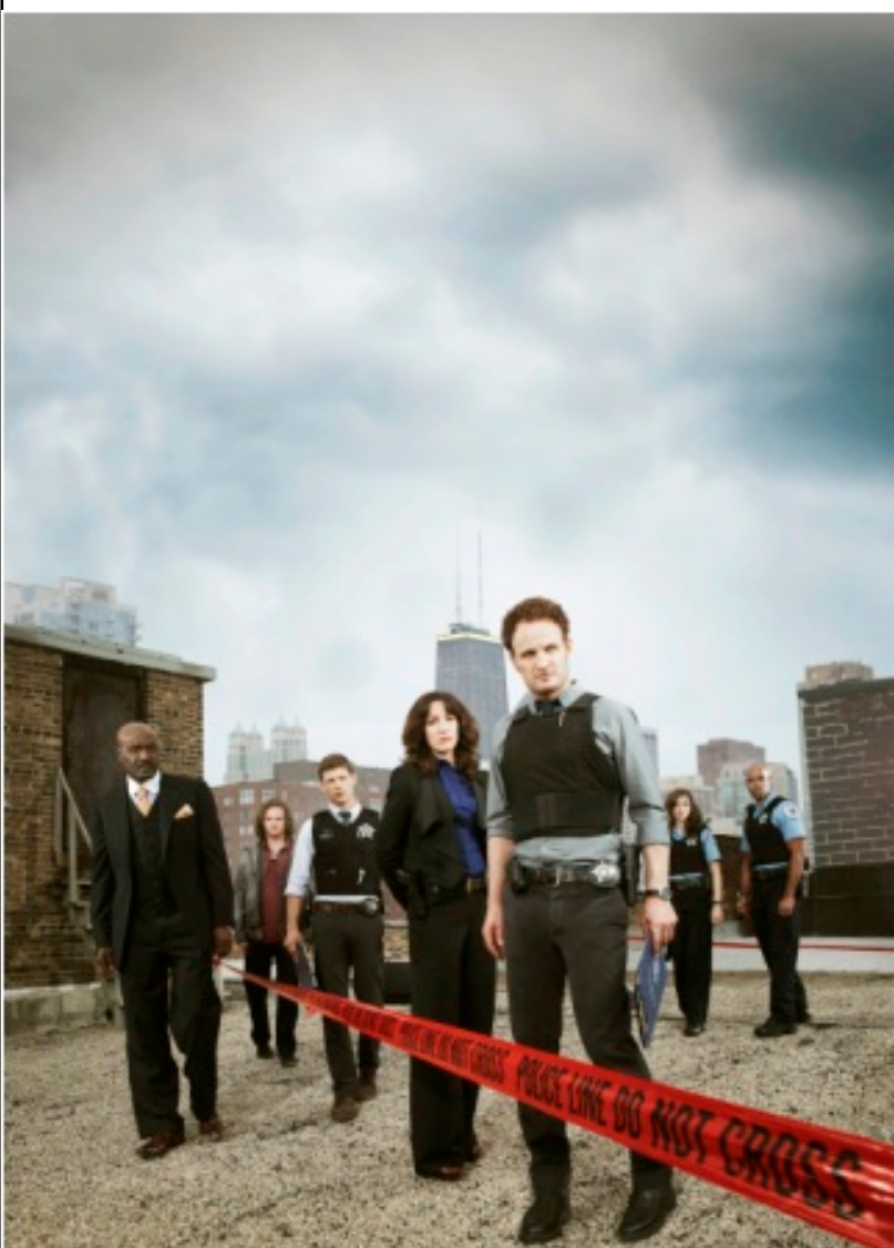
The Chicago Code