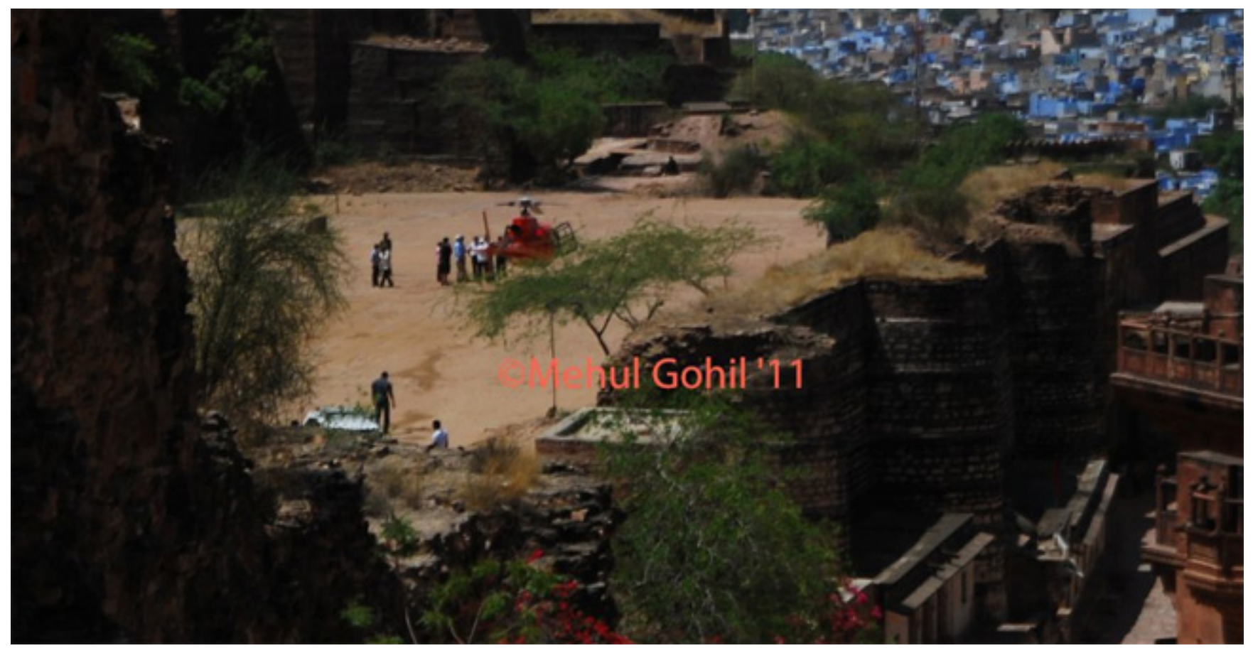
The set of "The Dark Knight Rises" in Jodhpur, India.