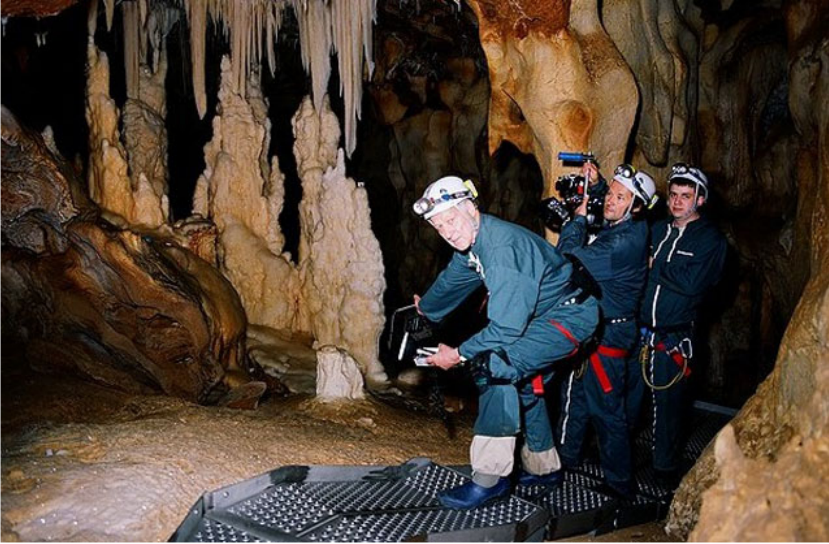
On the Inside: Werner Herzog Leads His Crew Into the 'Cave of Forgotten Dreams'