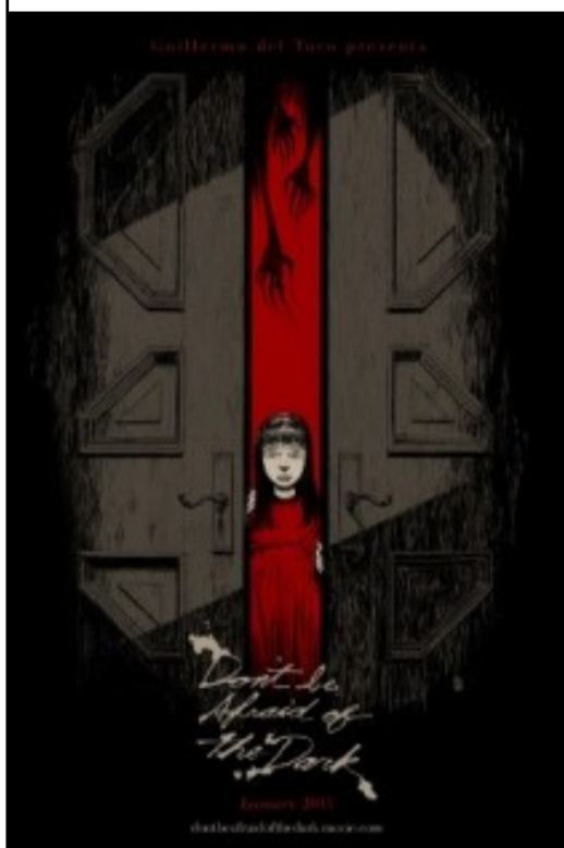
Don't Be Afraid of the Dark

Why It Might Suck: ...But Marvel has screwed us before. Hard. It's been three years since "Iron Man," and "The Incredible Hulk," "X-Men Origins: Wolverine," and "Iron Man 2" have all ranged from disappointing to horrendous. Honestly, Marvel needs another hit franchise now. Please let this be it. Don't make us wait for "Captain America."