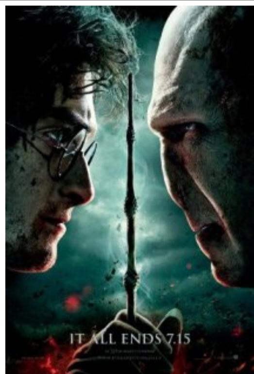
Harry Potter and the Deathly Hallows — Part 2

Why It Might Suck: The preview gives off the impression that the script — the witty banter and insightful look at modern relationships — is going to be key to the success of this film. And, despite what those who have read the script have said, screenwriter Dan Fogelman, primarily known for kids movies like "Cars" and "Bolt," doesn't exactly strike a note of confidence with his resume. Anyone involved with "Fred Claus," which he also "wrote," has some atoning to do.