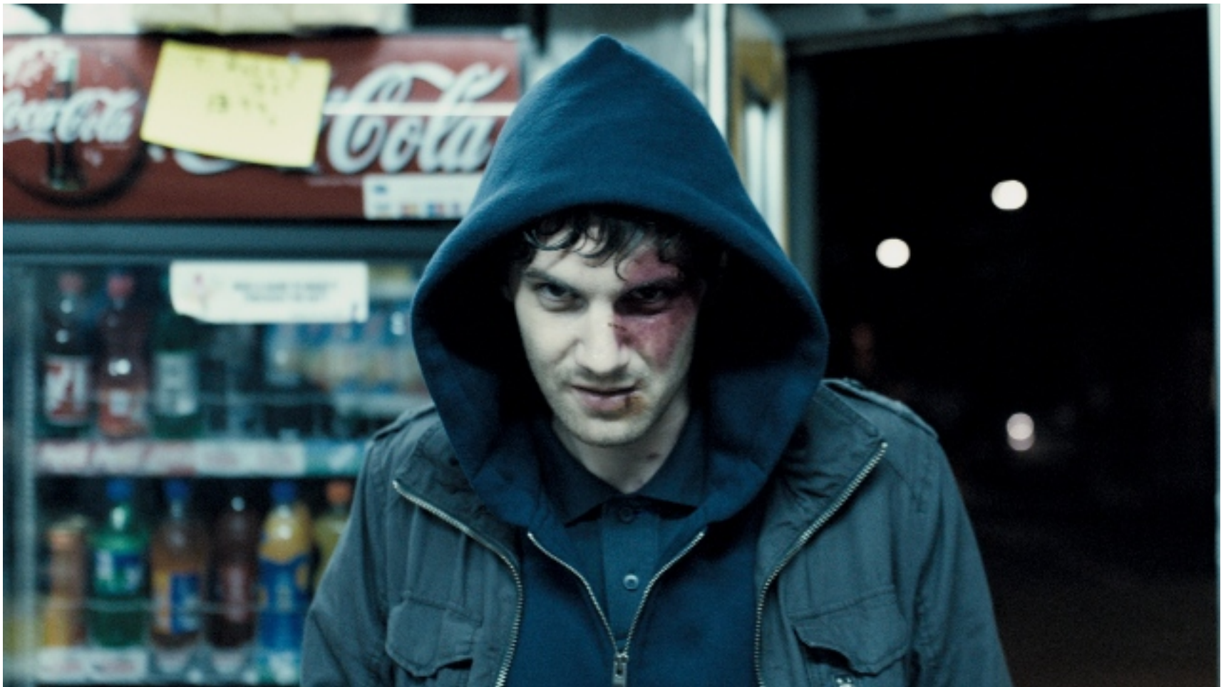
Heartless was released on DVD on April 12th, 2011

“Love can never be eternal. Only suffering can be eternal.” There have been films made about selling your soul to the devil and finding something much worse than you can even imagine in return but few have been as brazenly bizarre as “Heartless,” a film that starts with visions of hooded creatures and eventually gets to the point where a talking disembodied head is being eaten. At its best, “Heartless” reminds one of Dario Argento’s work in the way its creators are willing to play with ideas, themes, and concepts more than literal plotlines or characters. The film works best when it is defiantly open to interpretation, whether our protagonist is self-immolating to enter his deal with the devil or speaking to an imaginary Indian girl. It doesn’t need to “make sense” as long as it’s this thematically rich.