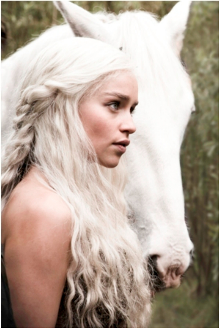
Game of Thrones

What story could possibly entwine this many speaking roles? Well, here's where things get tricky. The first episode ends with two shockers so jaw-dropping that only a jerk would dare spoil them here (and HBO has asked us not to do so) and so it's difficult to really discuss the plot of the program at all. The plot specifics aren't as important to the success of "Game of Thrones" as the intangibles that so many programs miss like atmosphere and that sense that winter truly is coming.