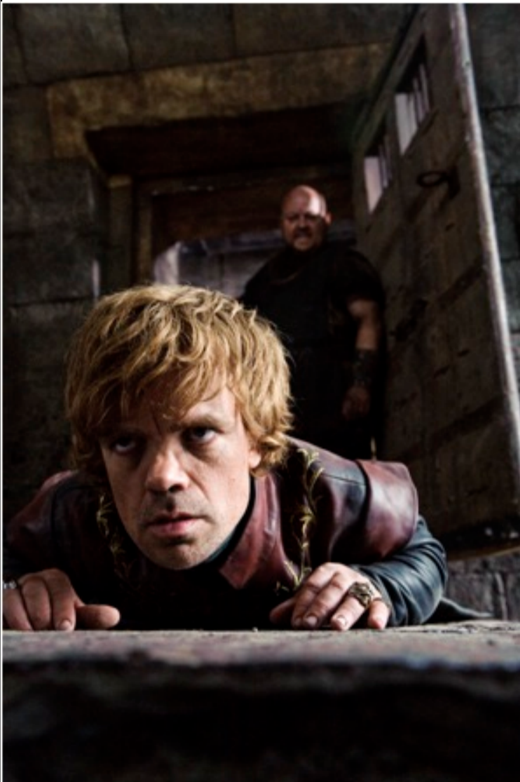
Game of Thrones

premiere in quite some time. It is a complex, nearly flawless venture that may be a bit too dense for some viewers but will greatly reward those willing to do a bit of heavy lifting with their drama. If you were scared off by the multiple arcs on programs like "The Wire" or "Deadwood," then this will be no easier affair. In fact, it's a daringly layered piece with dozens of characters to track, relate, and follow.