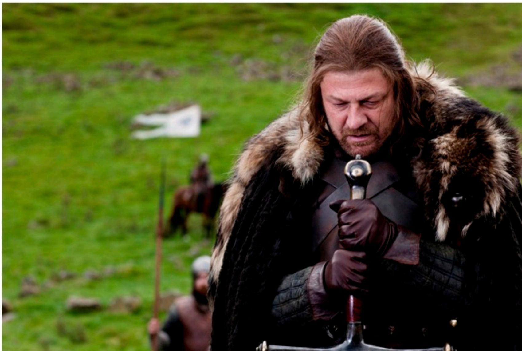
Game of Thrones

The tagline for “Game of Thrones” and a phrase repeated by Lord Eddard “Ned” Stark (Sean Bean) on the program has been “ Winter is Coming ” (the other being the also-appropriate “ You Win or You Die ”). The line sets the stage for a program steeped in dread. Whether it's a character's incredibly dark secrets rising to the surface, the fact that rulers don't rule for long in this world, or the literal threat of something dangerous on the edge of this civilization, “Game of Thrones” features a constant atmosphere of danger. It's one of the program's greatest successes that it always feels slightly on edge, like even the most casual encounter could lead to kingdom-changing catastrophe.