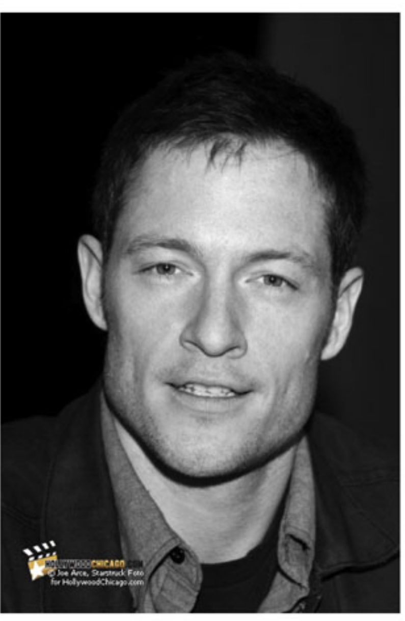
Panel of the Dolls: Eliza Dushku & Tahmoh Penikett, C2E2, March 19th, 2011

Question: Eliza, what were some of the challenges as an actor that you had to experience in 'Dollhouse?'