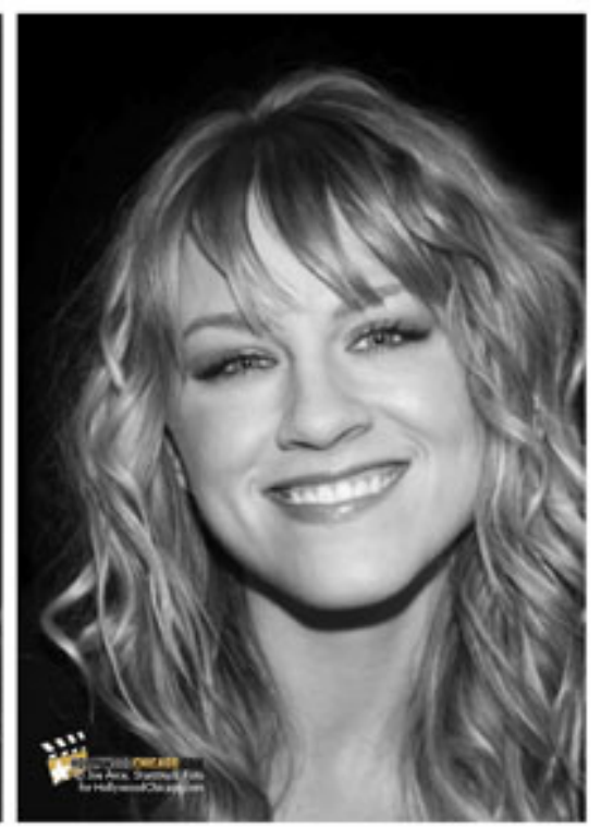
True Love: Sam Trammell, Kristen Bauer (center) & Brit Morgan, C2E2, March 19th, 2011

Question: Brit, what were the circumstances of you joining 'True Blood'?