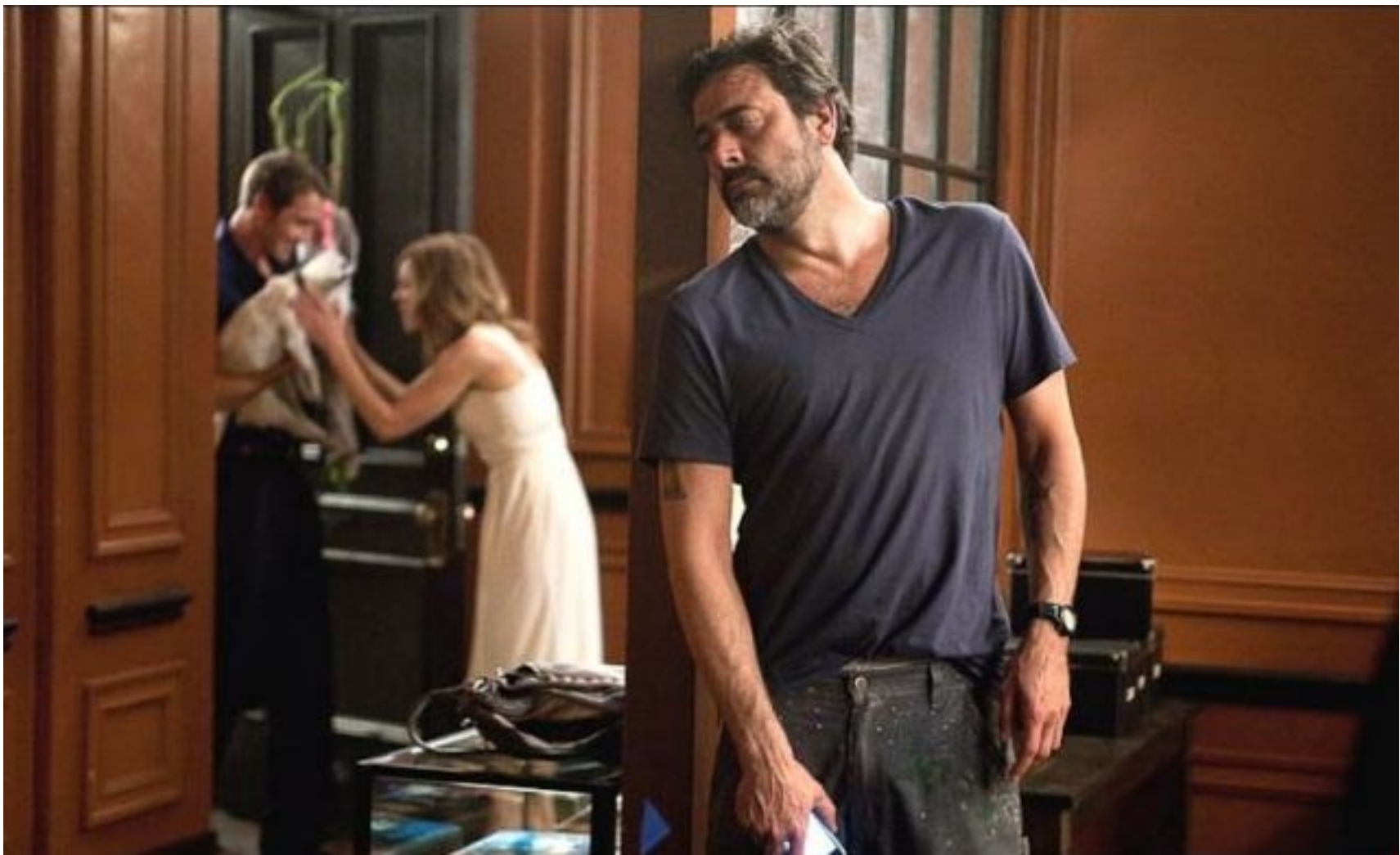
The Resident was released on Blu-Ray and DVD on March 29th, 2011

Considering the fact that the back of the box tries to sell “The Resident” as a supernatural thriller (“... an evil you can’t see...until it’s too late ”), one could consider what’s to follow a spoiler, but it’s so obvious from minute one and revealed well before the halfway mark that I’m not sure too much of a warning is necessary — the theme of “The Resident” is quite simply “Don’t trust a real estate deal that’s too good to be true.”