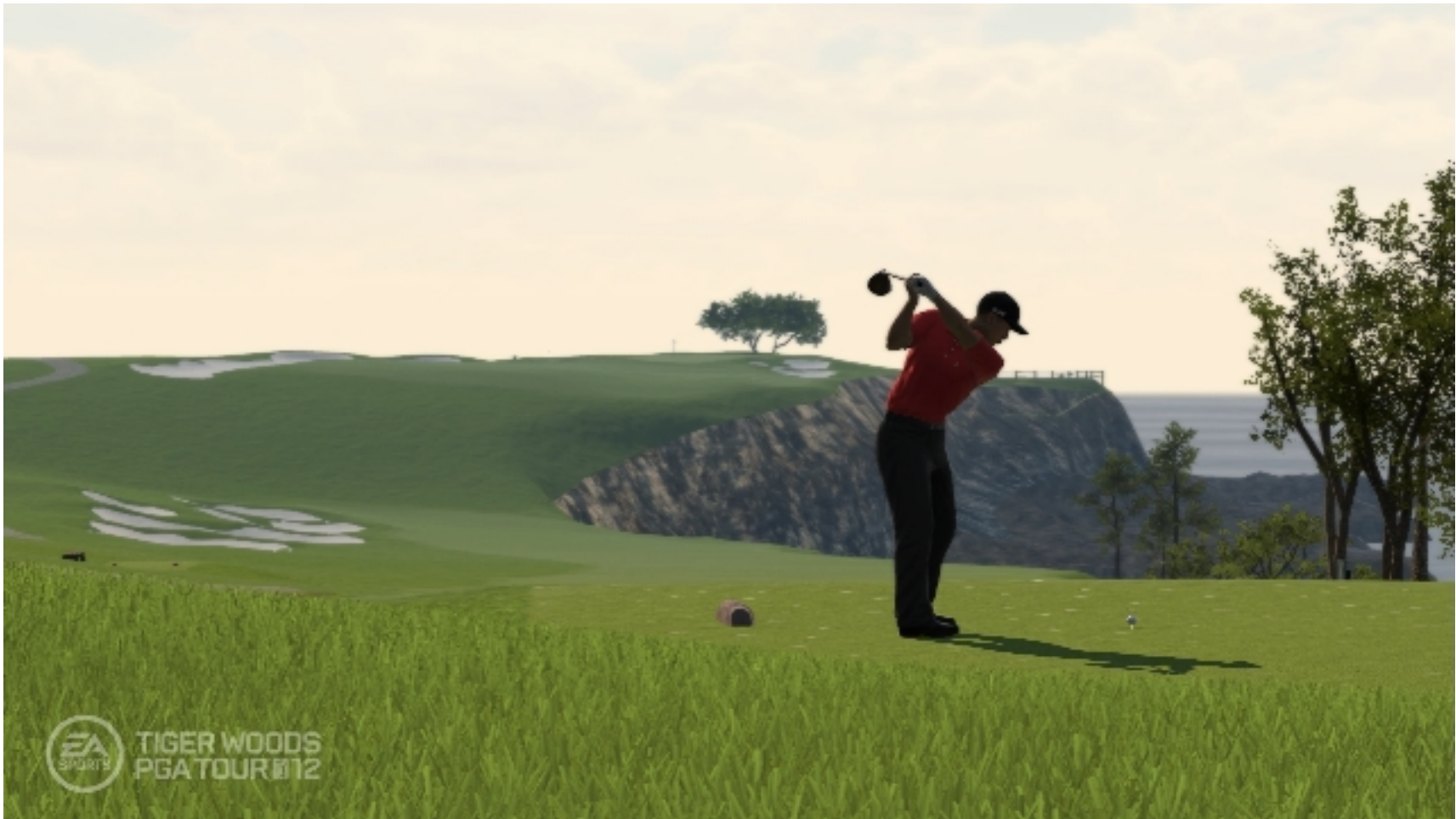
Tiger Woods PGA Tour 12: The Masters

Last year, they tried to draw attention away from its star’s personal problems by introducing the team play of the Ryder Cup and this year’s edition feels similarly distracted from its lead (who’s not even really on the cover of one edition of the game, as you can see below), moving focus to, of all people, the caddie. In one of the best additions to a sports game in a long time, EA has added a partner for your gameplay, a man who can advise you on the best club, strength percentage, and angle to take for every shot. It adds accessibility and speed to the title in much the same way that “Gameflow” added to “Madden NFL 11” although it’s an even more landmark development for the game.