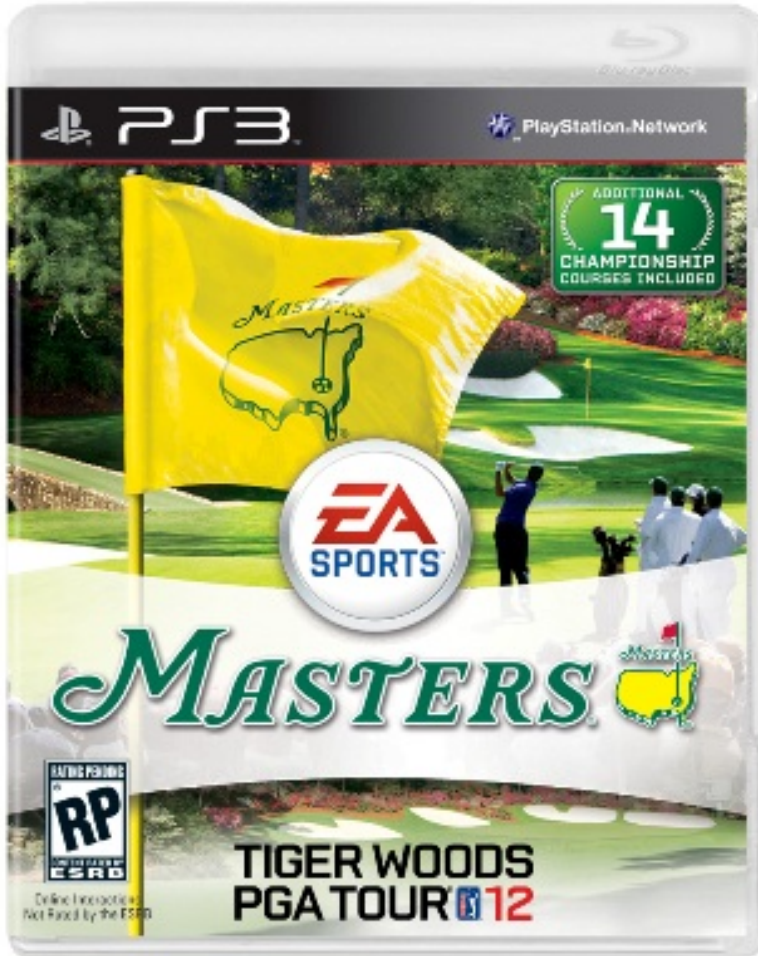
Tiger Woods PGA Tour 12: The Masters