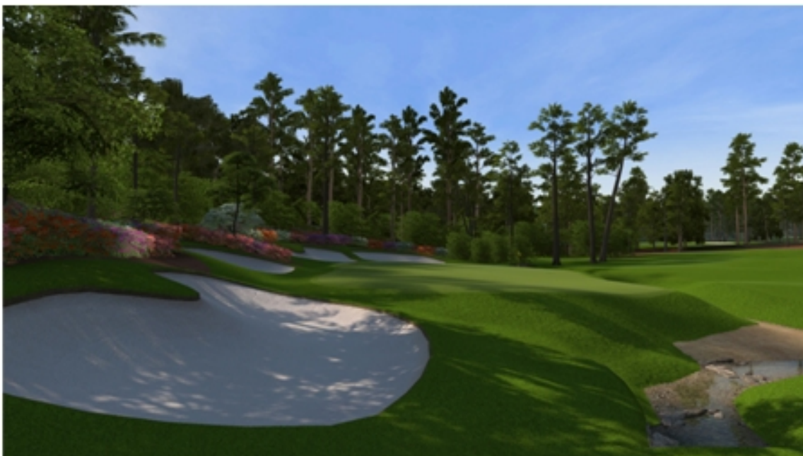
Tiger Woods PGA Tour 12: The Masters

"Tiger Woods PGA Tour 12: The Masters" is not perfect. Some of the animations look downright goofy, especially the scant crowds who all clap and look in the same direction like a bunch of robots. Don't bother to put people on the side of the course if they don't look better than this. The hole design/recreation is remarkable but the graphics of the humans need more work.