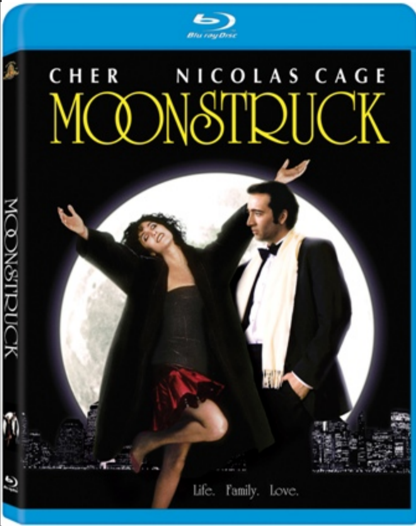
Moonstruck

Fans of “Rain Man” and “Moonstruck” will be happy to learn that the special features previously available on their DVDs have made the transfer to HD. As for how well the films have held up, I’ll leave that up to the eye of the beholder. Personally, I never thought “Rain Man” deserved to win Best Picture (nor Actor, even though I think Dustin Hoffman to be one of the best that ever lived...he just didn’t deserve it for this role) and “Moonstruck” looks particularly dated now. It’s still a lot of fun though, especially for Cher fans. She was arguably never better.