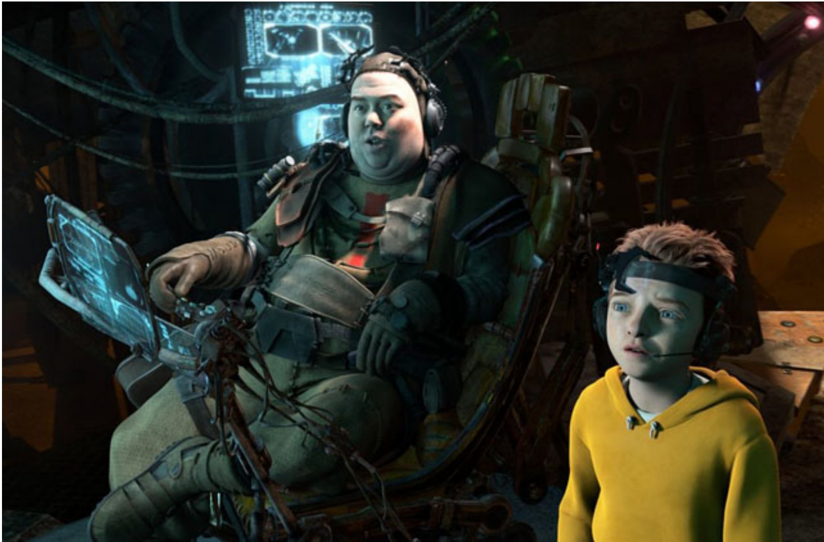
Nerve Center: Gribble (Voice of Dan Folger) and Milo (Seth Green) in ‘Mars Need Moms’

★ Continue reading for Patrick McDonald’s full review of “Mars Needs Moms” [14]