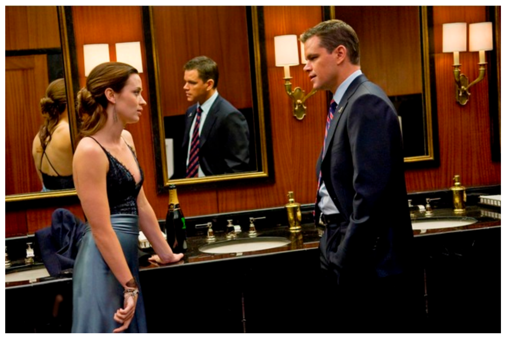
The Adjustment Bureau

Published on HollywoodChicago.com (http://www.hollywoodchicago.com)