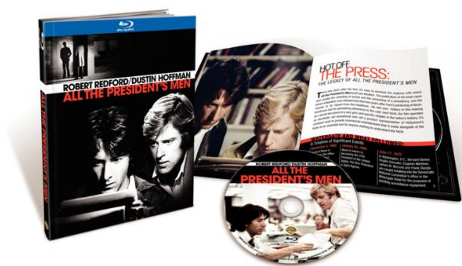
All the President’s Men was released on Blu-Ray on February 15th, 2011

1976 was a hell of a year. It makes it all the more remarkable that the unknown Sylvester Stallone climbed all the way to Best Picture with “Rocky” when one considers that the film beat “All the President’s Men,” “Bound For Glory,” “Network,” and “Taxi Driver.” (And “Carrie” and “Marathon Man” weren’t even nominated.) Two of the best from that entire era, and two films that have held up remarkably well, have just hit Blu-ray for the first time.