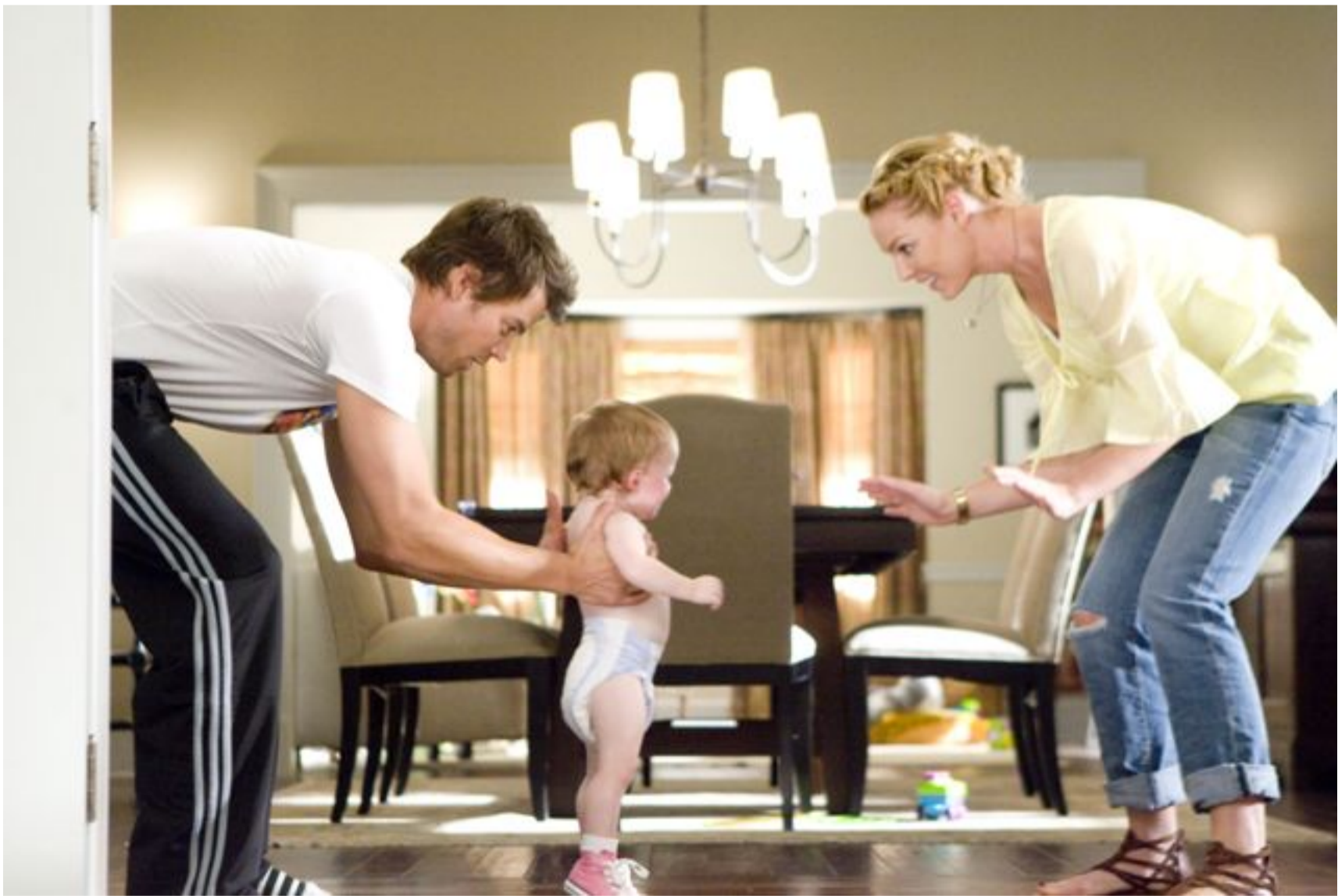
Life As We Know It was released on Blu-Ray and DVD on February 8th, 2011

To be fair, Heigl is better here than in the other three chapters of the quartet of romantic crap, but that almost makes it worse. You can see glimpses of the quality actress she could be if she just fired her agent or hired someone to find her better scripts. Even Josh Duhamel, an actor who once seemed charming but more often seems bored now, finds more character here than in junk like “When in Rome,” but neither of the stars can do anything to save this project that doesn’t understand family, friendship, romance, or, most of all, parenthood.