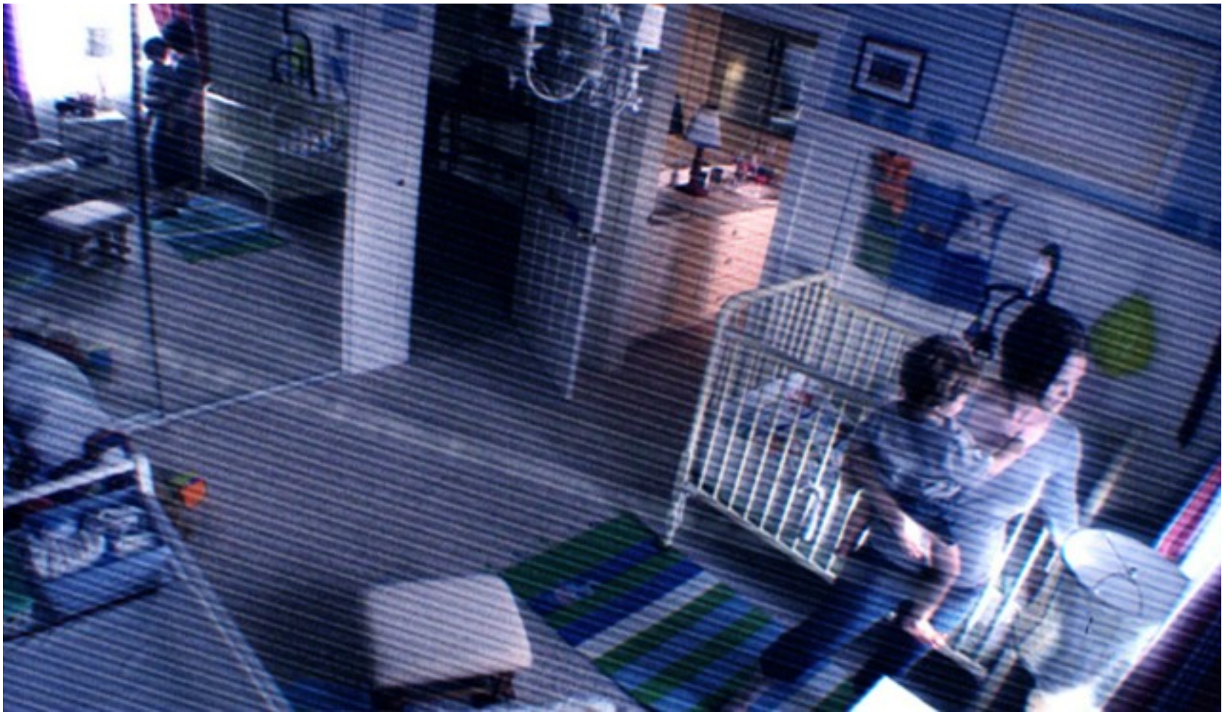
Paranormal Activity 2 was released on Blu-Ray and DVD on February 8th, 2011