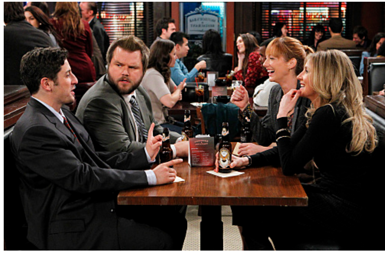
Mad Love

So, when I say that "Mad Love" is the kind of program that the characters on "How I Met Your Mother" would watch, it's not meant as an insult. With its NYC backdrop, pop culture sensibilities, and tales of pretty young people in neurotic love, "Mad Love" could practically have been a spin-off of one of CBS' most successful programs of the last several years. And it's likely to find a similarly loyal audience if it can maintain the promise of its premiere.