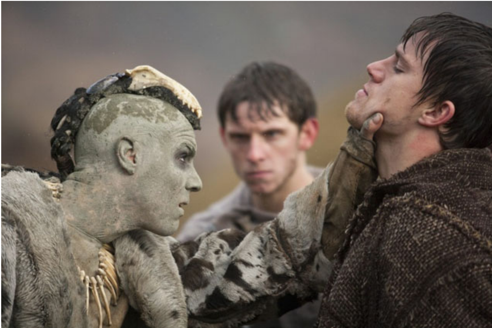
Enemy Mine: Tahar Rahim (left), Jamie Bell (center) and Channing Tatum in ‘The Eagle’