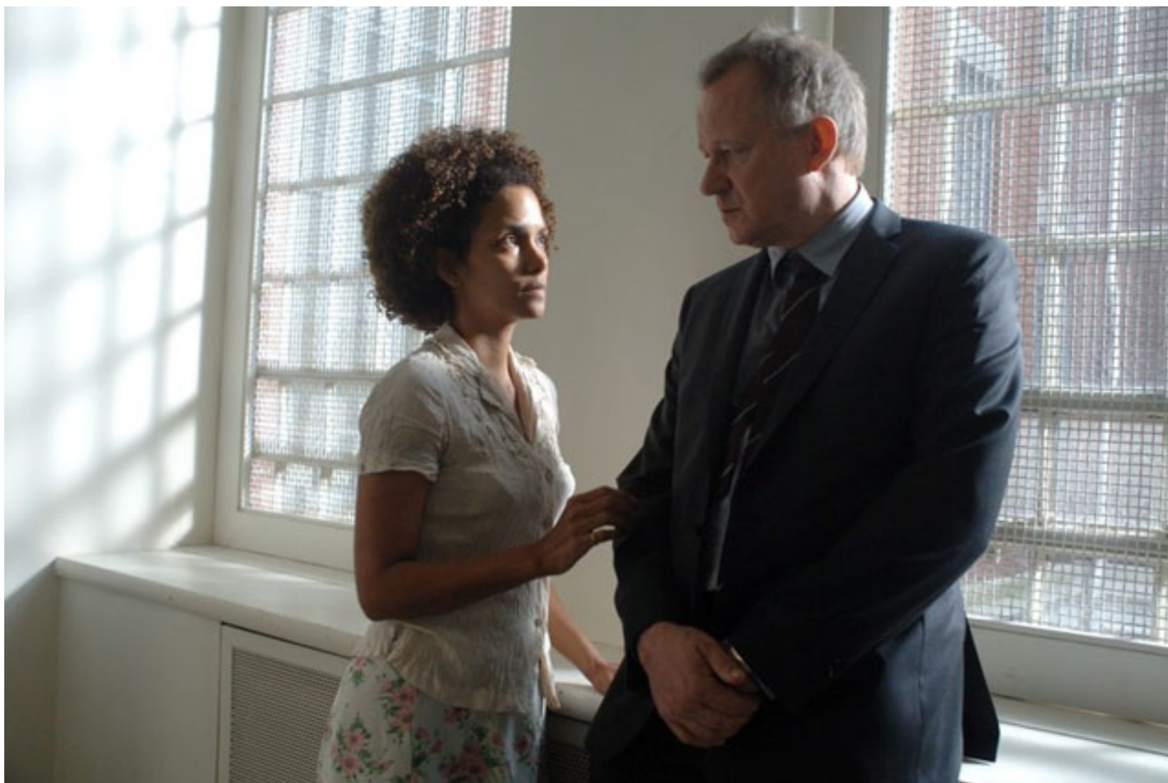
Free to Be: Halle Berry as Frankie and Stellan Skarsgard as Oz in 'Frankie and Alice'