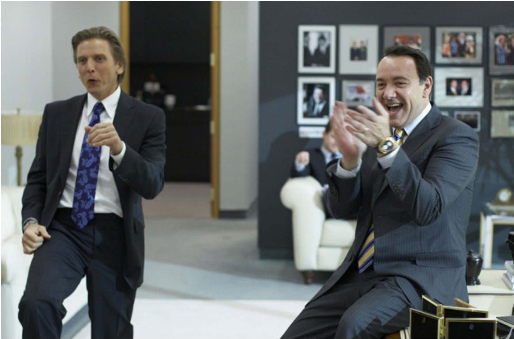
Schemers: Barry Peppers as Michael Scalon and Kevin Spacey as Jack Abramoff in 'Casino Jack'