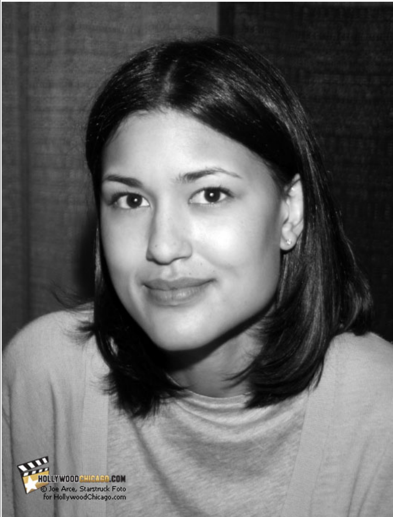
Julia Jones at the Wizard World Chicago Comic Con, August, 2010

Julia Jones was doing some notable TV and film appearances when she landed the part of Leah Clearwater in The Twilight Saga. She will reprise the role in the upcoming "Breaking Dawn, Part 1."