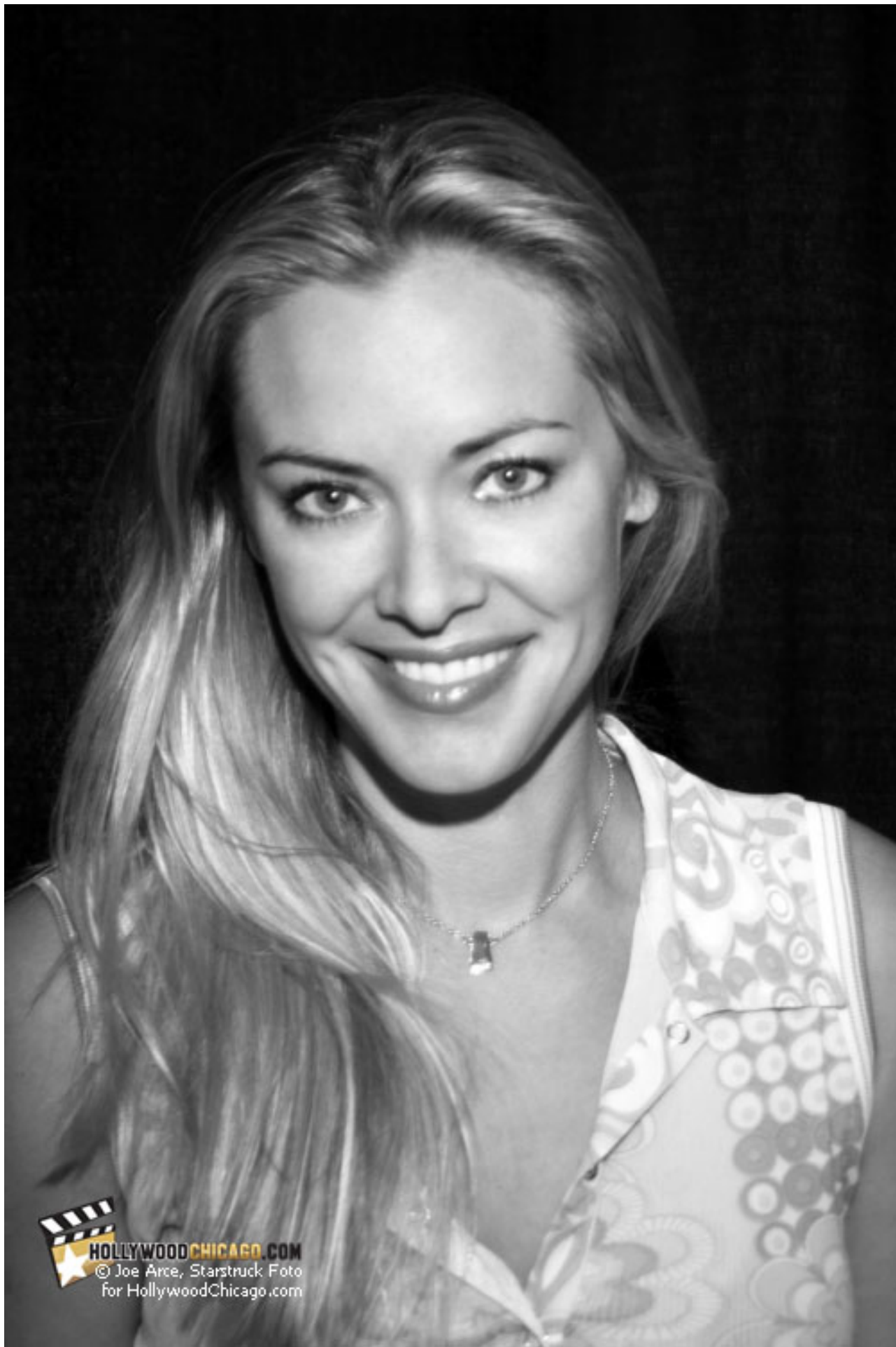
Kristanna Loken at the Wizard World Chicago Comic Con, August, 2010