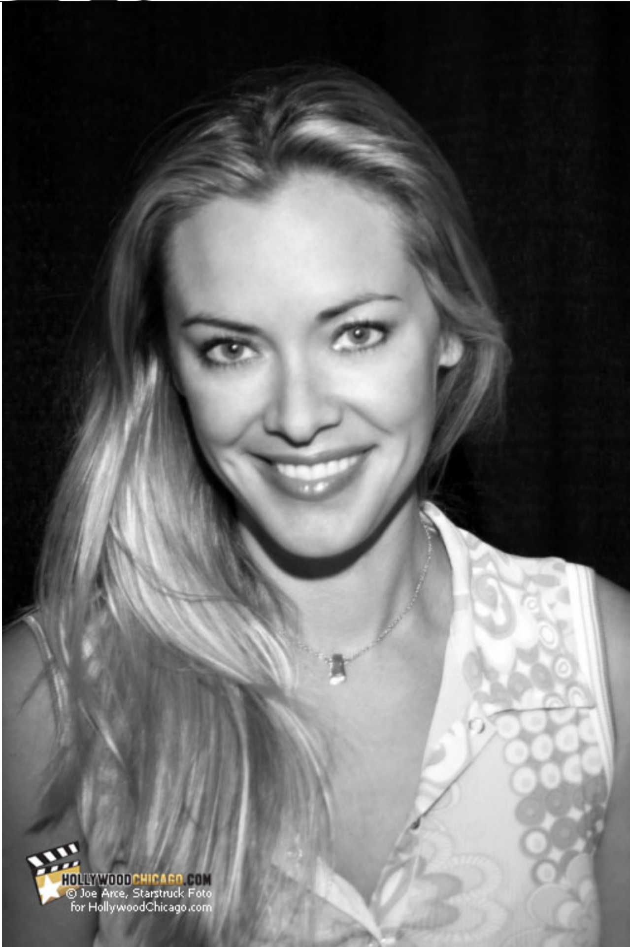
Kristanna Loken at the Wizard World Chicago Comic Con, August, 2010

HollywoodChicago.com: How did working on “As the World Turns” daytime drama help you evolve into a professional actor?