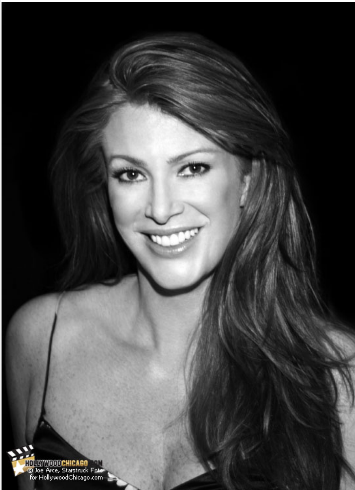
Angie Everhart at the Wizard World Chicago Comic Con, August, 2010

She also gained a bit of notoriety with engagements to Sylvester Stallone in 1995 and Joe Pesci in 2007. She was also linked briefly to shock jock Howard Stern.