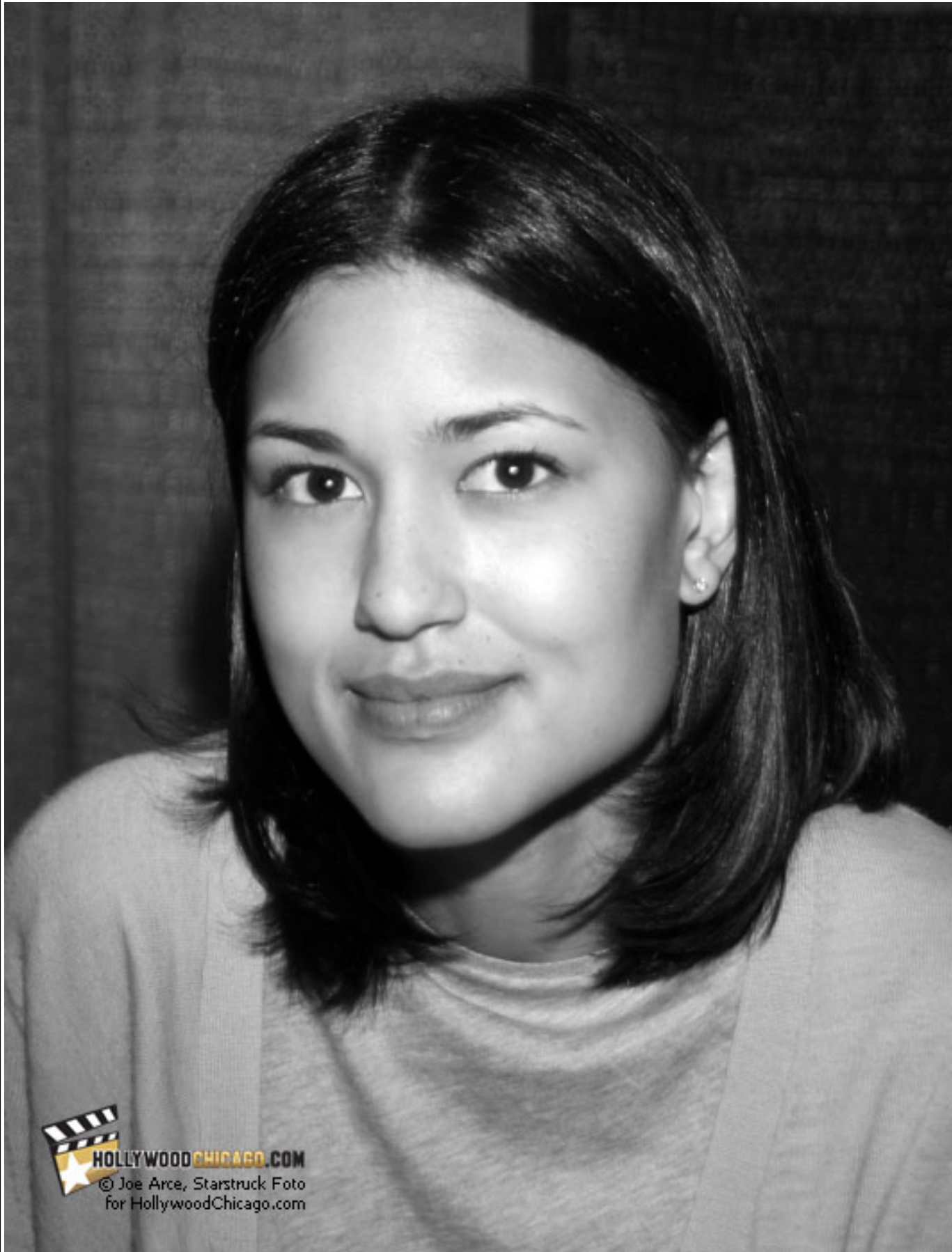
Julia Jones at the Wizard World Chicago Comic Con, August, 2010

Julia Jones was doing some notable TV and film appearances when she landed the part of Leah Clearwater in The Twilight Saga. She will reprise the role in the upcoming “Breaking Dawn, Part 1.”