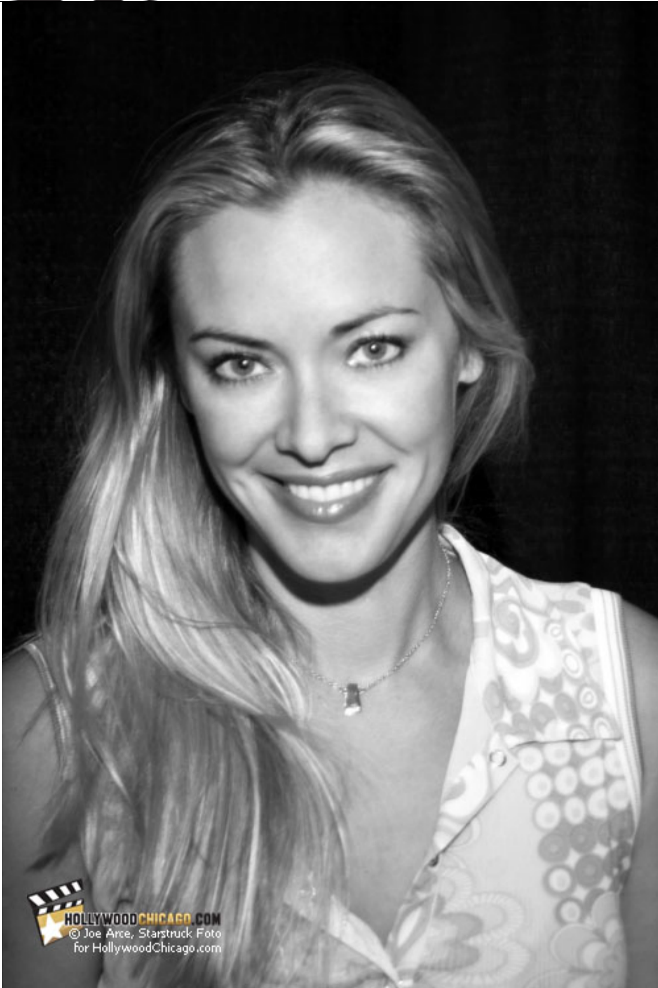
Kristanna Loken at the Wizard World Chicago Comic Con, August, 2010

HollywoodChicago.com: How did working on “As the World Turns” daytime drama help you evolve into a professional actor?