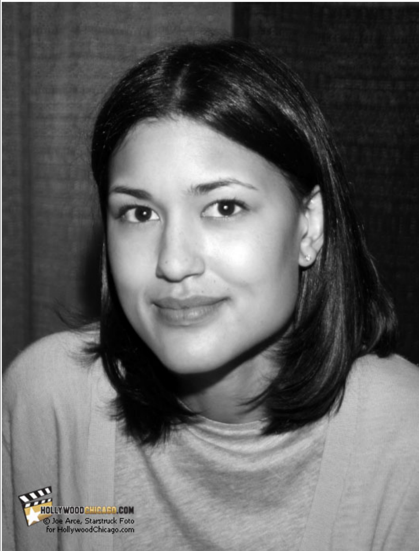
Julia Jones at the Wizard World Chicago Comic Con, August, 2010

Julia Jones was doing some notable TV and film appearances when she landed the part of Leah Clearwater in The Twilight Saga. She will reprise the role in the upcoming "Breaking Dawn, Part 1."