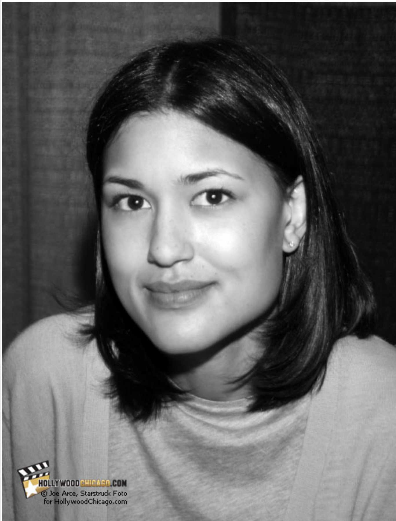
Julia Jones at the Wizard World Chicago Comic Con, August, 2010

Julia Jones was doing some notable TV and film appearances when she landed the part of Leah Clearwater in The Twilight Saga. She will reprise the role in the upcoming "Breaking Dawn, Part 1."