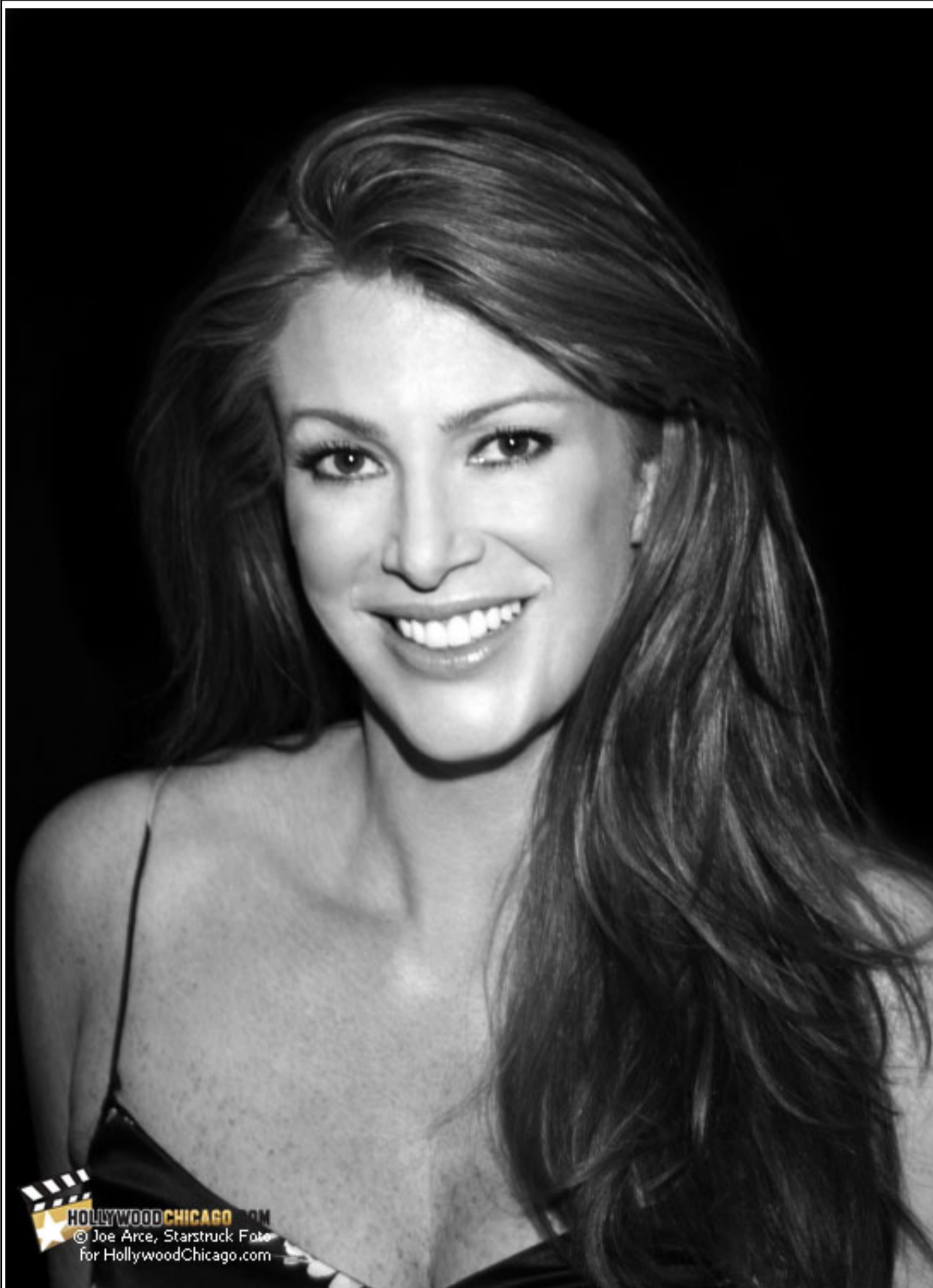
Angie Everhart at the Wizard World Chicago Comic Con, August, 2010

She also gained a bit of notoriety with engagements to Sylvester Stallone in 1995 and Joe Pesci in 2007. She was also linked briefly to shock jock Howard Stern.