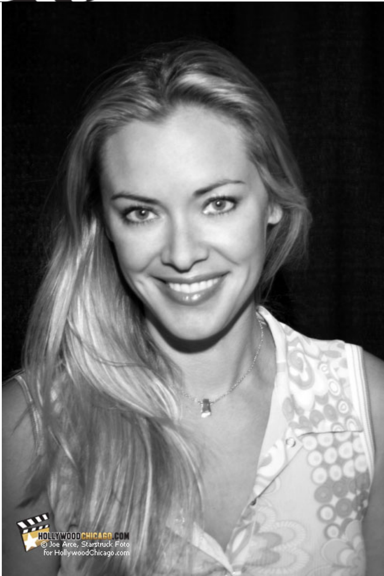
Kristanna Loken at the Wizard World Chicago Comic Con, August, 2010

HollywoodChicago.com: How did working on “As the World Turns” daytime drama help you evolve into a professional actor?