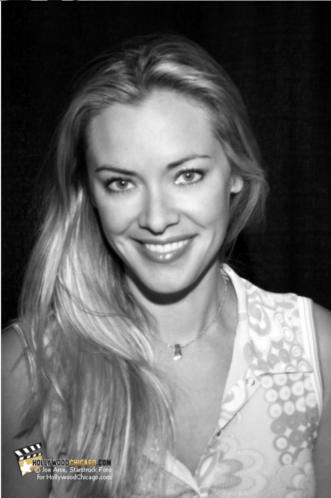
Kristanna Loken at the Wizard World Chicago Comic Con, August, 2010

HollywoodChicago.com: How did working on “As the World Turns” daytime drama help you evolve into a professional actor?