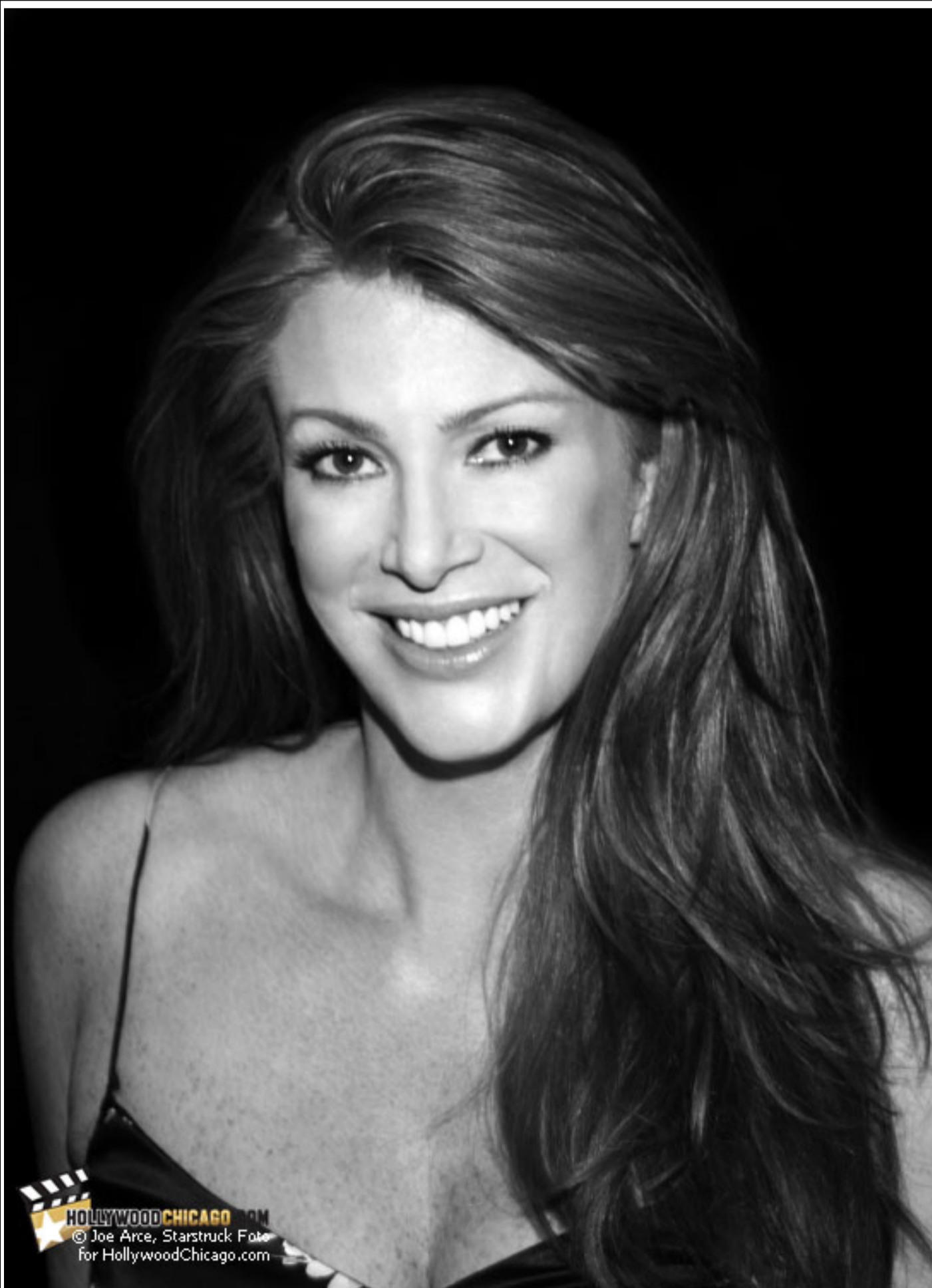
Angie Everhart at the Wizard World Chicago Comic Con, August, 2010

She also gained a bit of notoriety with engagements to Sylvester Stallone in 1995 and Joe Pesci in 2007. She was also linked briefly to shock jock Howard Stern.