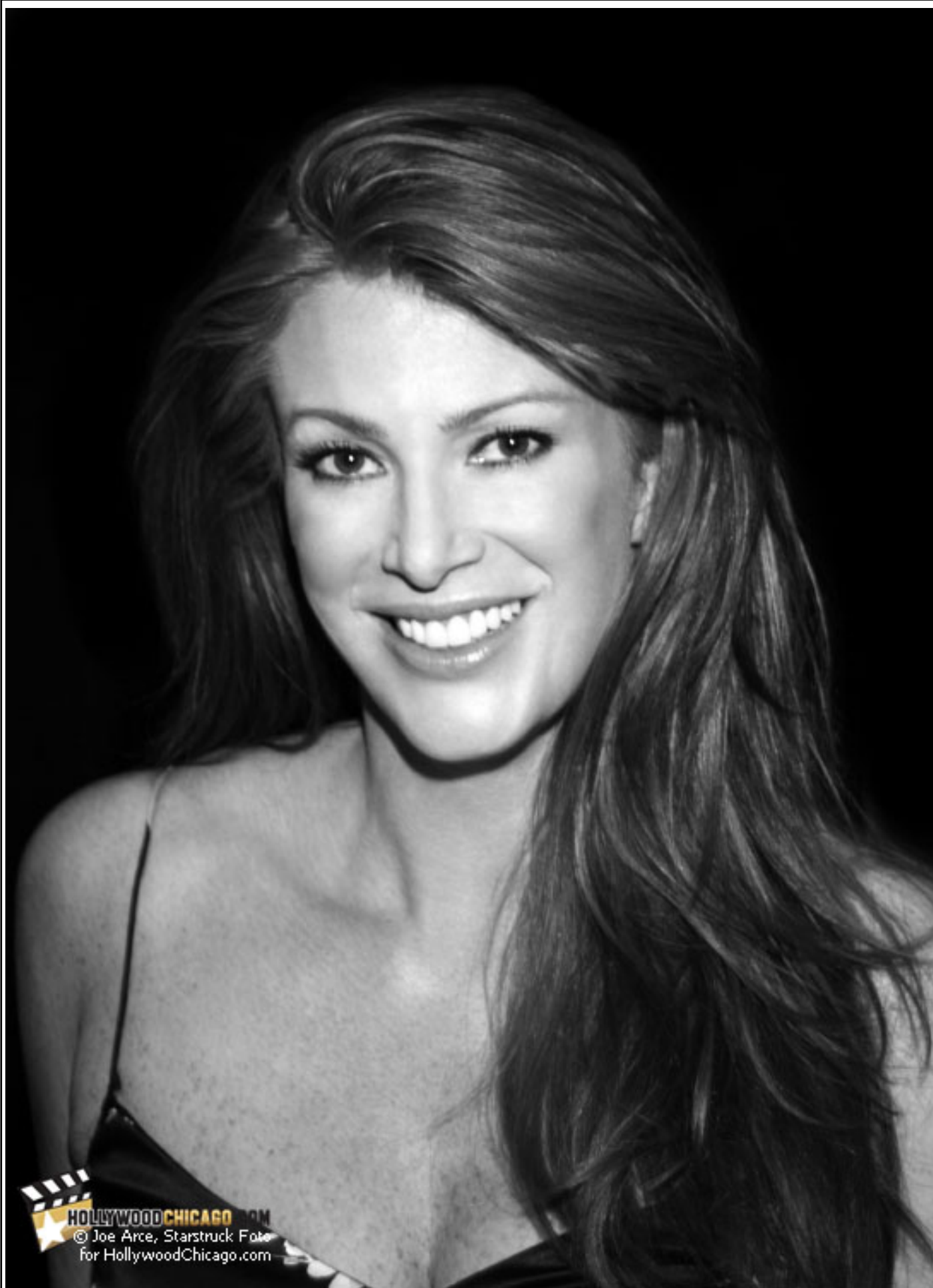
Angie Everhart at the Wizard World Chicago Comic Con, August, 2010

She also gained a bit of notoriety with engagements to Sylvester Stallone in 1995 and Joe Pesci in 2007. She was also linked briefly to shock jock Howard Stern.