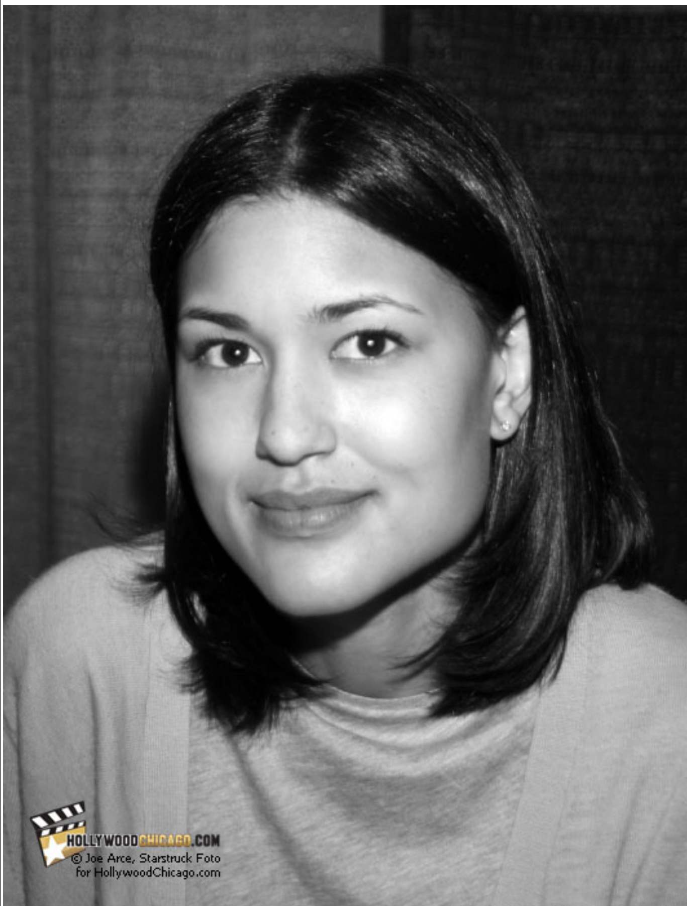
Julia Jones at the Wizard World Chicago Comic Con, August, 2010

Julia Jones was doing some notable TV and film appearances when she landed the part of Leah Clearwater in The Twilight Saga. She will reprise the role in the upcoming "Breaking Dawn, Part 1."