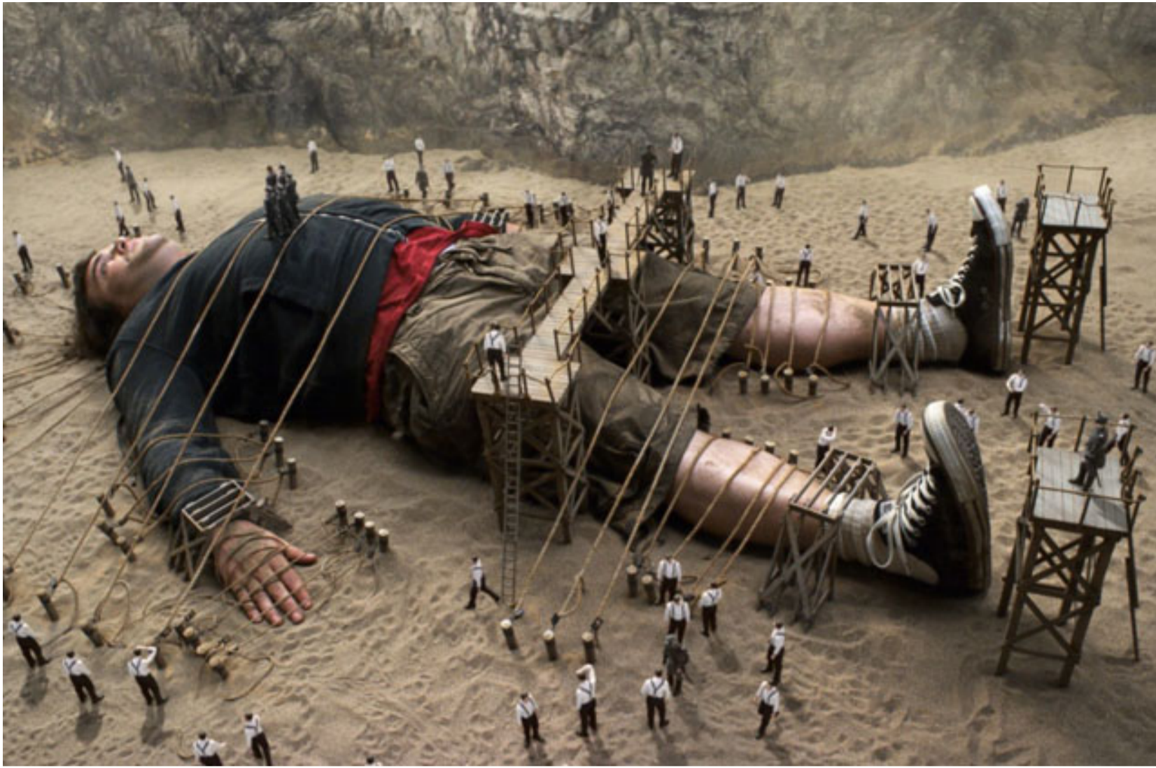
Wrapped up for the Holidays: Jack Black in 'Gulliver's Travels'

★ Continue reading for Patrick McDonald's full review of "Gulliver's Travels" [15]