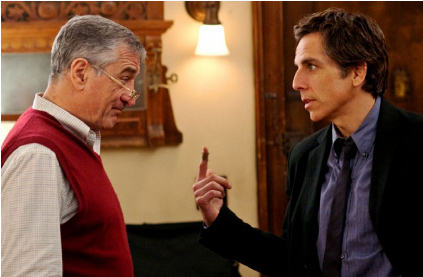
Jack (Robert De Niro) Gets the Wrong Finger from Greg (Ben Stiller) in ‘Little Fockers’