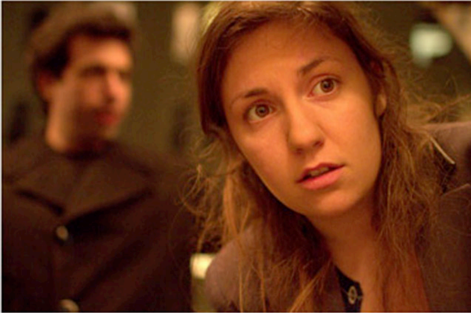
Through the Looking Glass: Lena Dunham as Aura in 'Tiny Furniture'