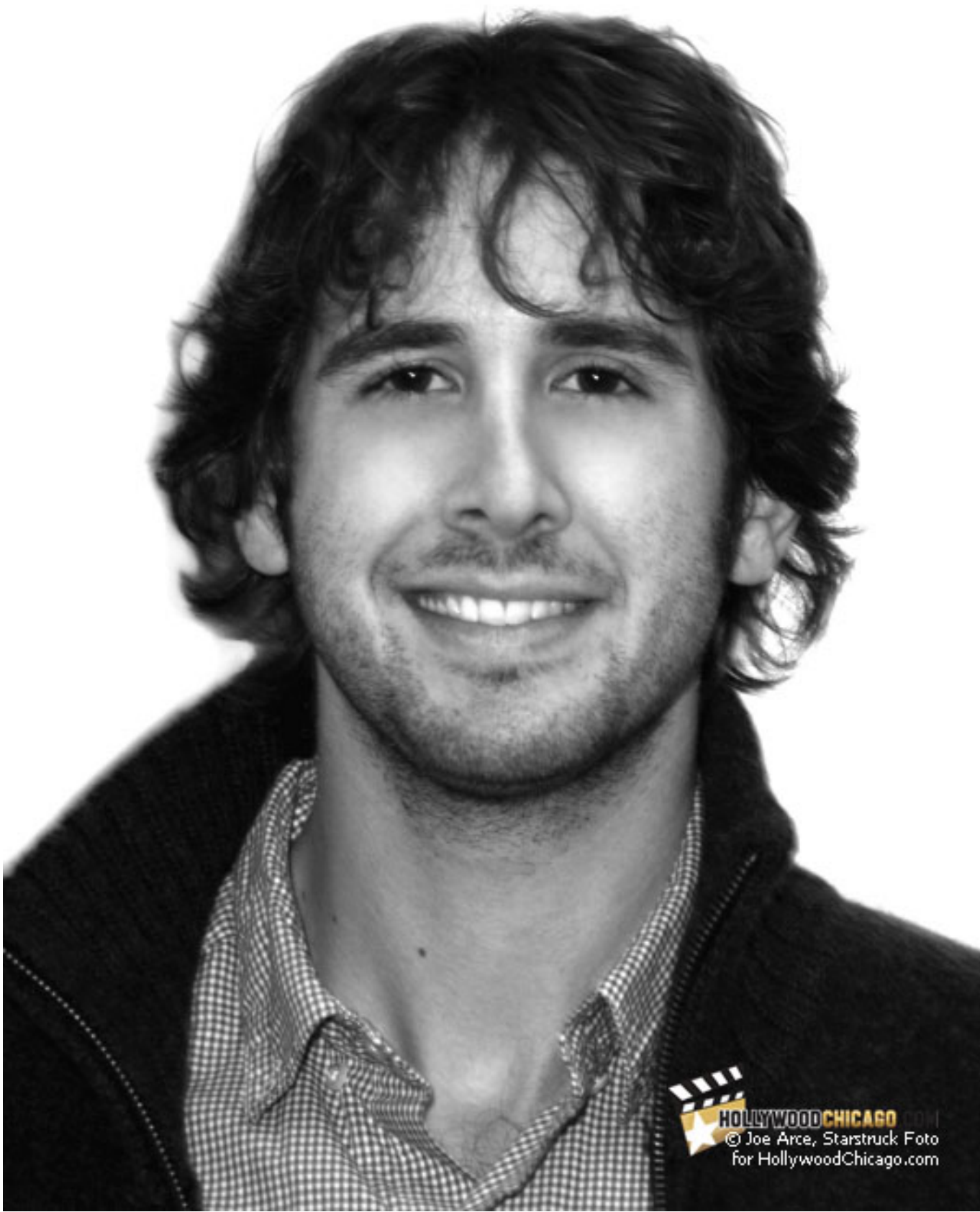
Favored Oprah Status: Josh Groban at his Appearance at Borders on State Street Chicago, November 17th, 2010

"Illuminations," a new CD by Josh Groban, is available at Borders Books or wherever music is sold.