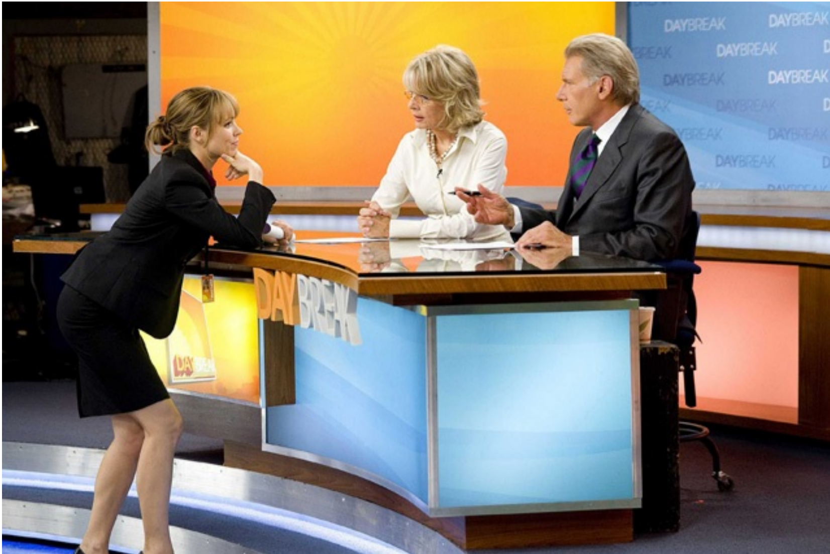
Some Rise: Rachel McAdams as Becky, Diane Keaton as Colleen and Harrison Ford as Mike in 'Morning Glory'