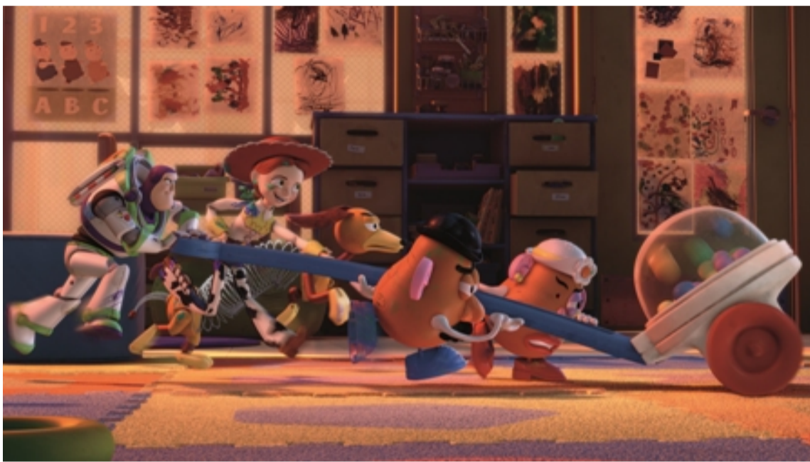
Toy Story 3 was released on Blu-ray and DVD on November 2nd, 2010

Everyone with an HD TV should AT LEAST rent "Toy Story 3." It's stunningly beautiful with some of the best color mixing in 1080p that I've ever seen. It's gorgeous. And the sound is just as remarkable.