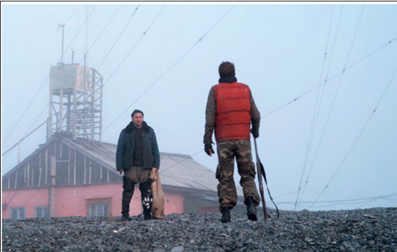
'How I Ended The Summer'

The Gold Hugo for Best Film: “How I Ended the Summer” (Russia), directed by Aleksei Popogrebsky