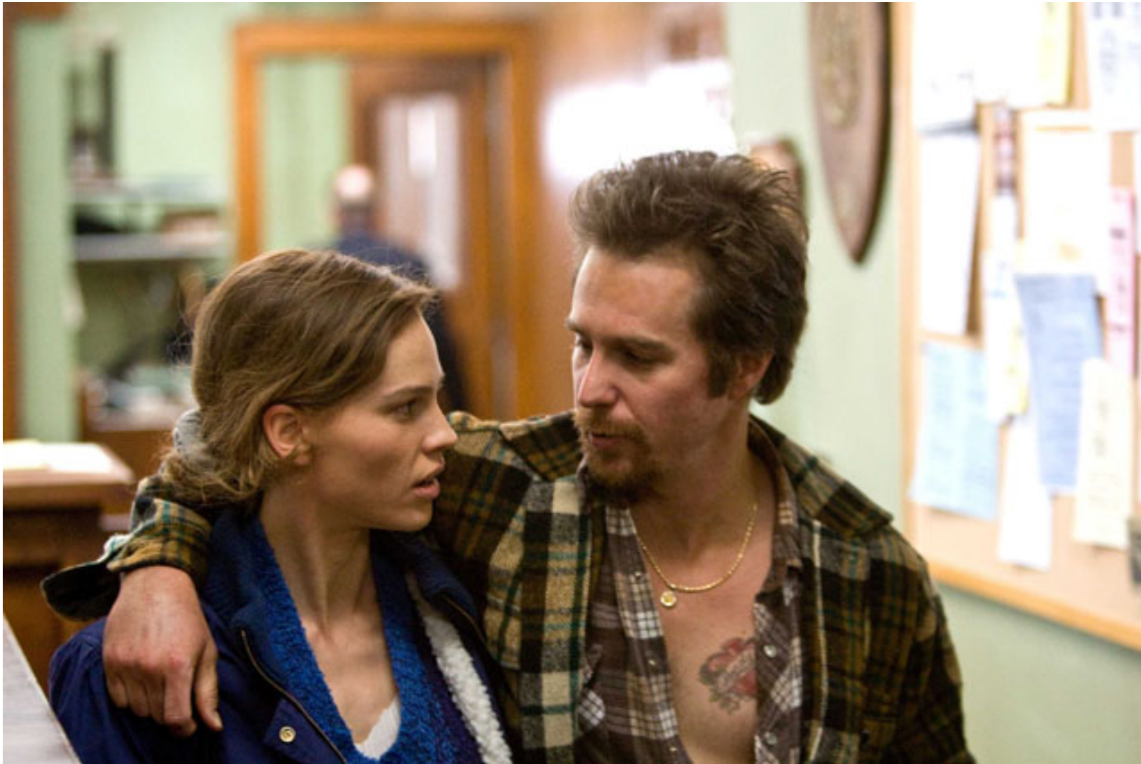
Sister and Brother: Hilary Swank as Betty Anne and Sam Rockwell as Kenny in ‘Conviction’