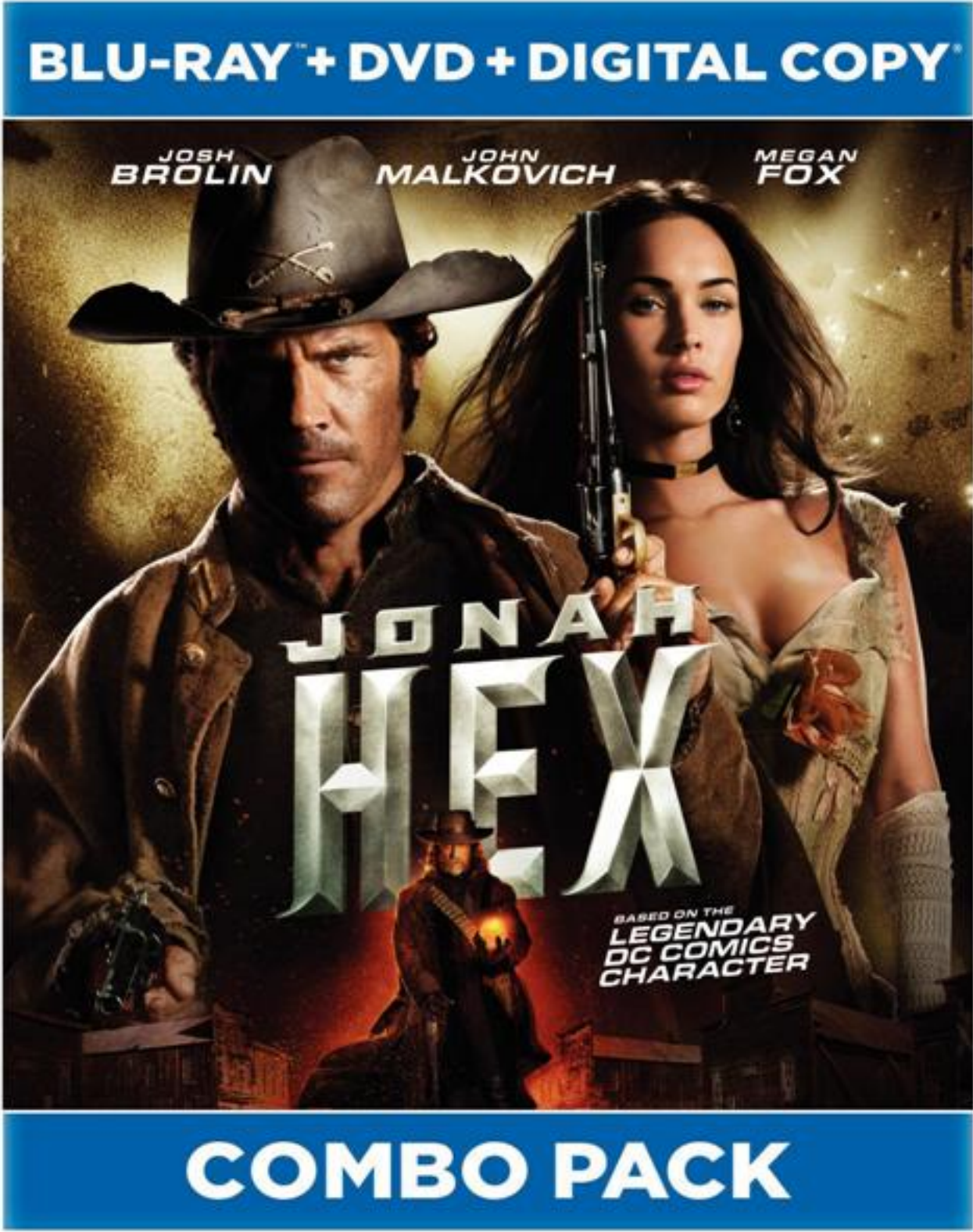
Jonah Hex was released on Blu-ray and DVD on October 12th, 2010

Josh Brolin somehow makes it out unscathed by virtue of being the only actor in the film who’s well-cast as the title character, a Civil War soldier who has been horribly scarred and left for dead by the evil Quentin Turnbull (John Malkovich). In fact, Hex came so close to the other side that he can still communicate with the dead whenever he needs crucial information (not unlike “Pushing Daisies”).