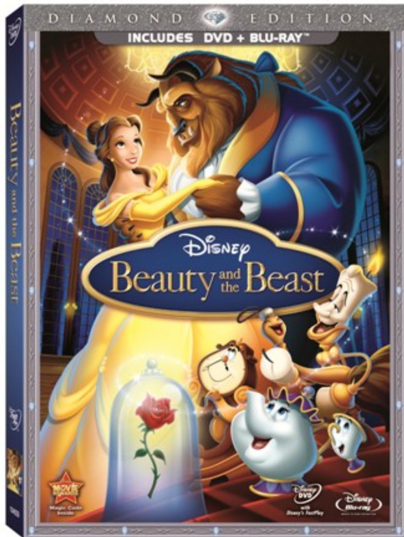
Beauty and the Beast: Diamond Edition was released on Blu-ray/DVD on October 5th, 2010