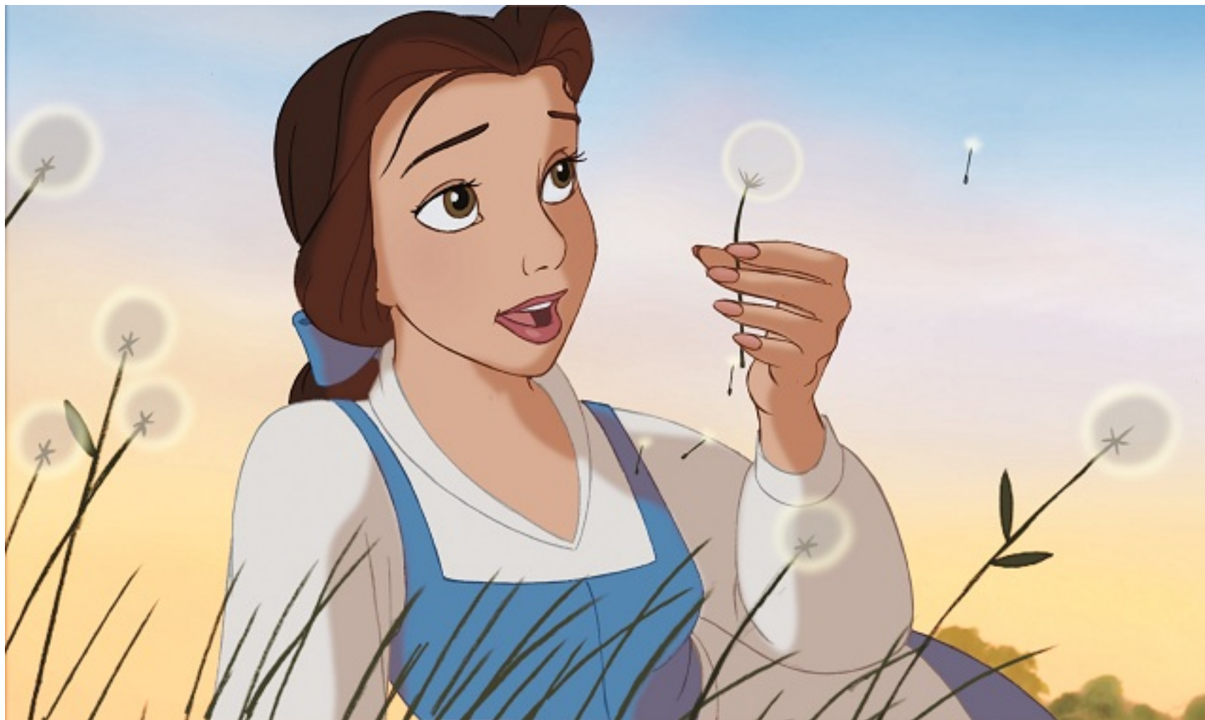
Beauty and the Beast: Diamond Edition was released on Blu-ray/DVD on October 5th, 2010

The quality of the image in Disney's Blu-ray version of "Beauty and the Beast" is hard to capture in words. The colors don't just pop off the screen. They're not just "bright." They're perfect. Every line detail, every background, every movement — being one of the favorite movies of a major Disney fan, I've seen "Beauty and the Beast" several times but the quality of this transfer made it feel new again. It's that remarkable. It's so noteworthy that if the release included nothing but the theatrical edition of the film and absolutely no bonus features, it would still be worth a purchase just for the timeless film itself.