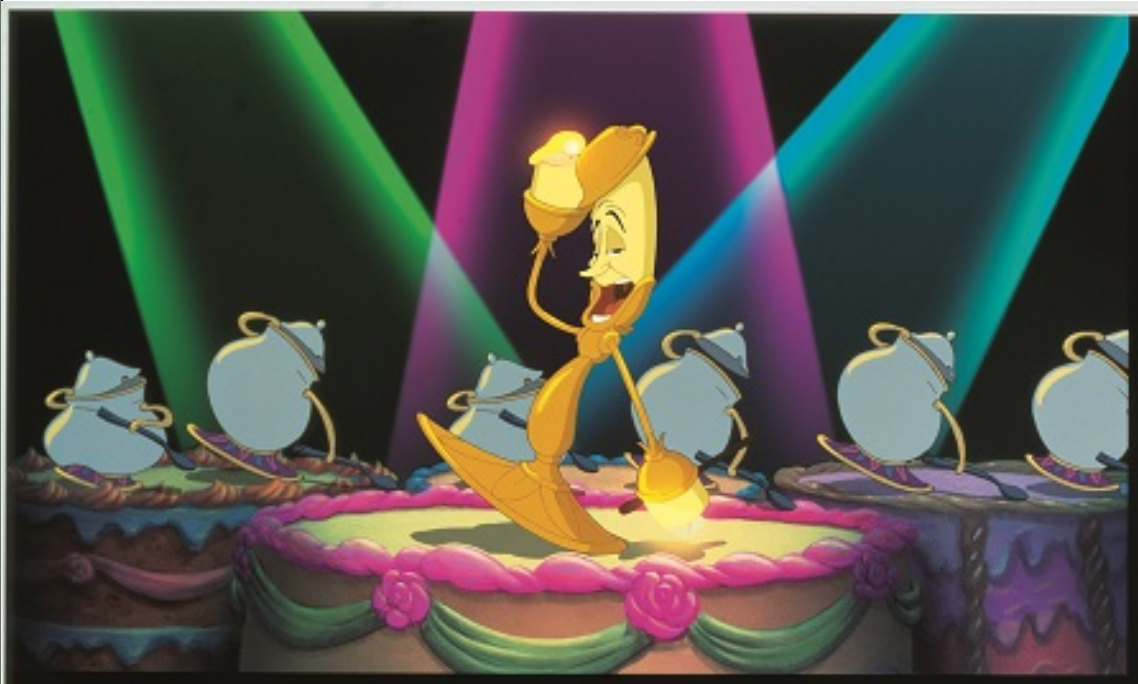
Beauty and the Beast: Diamond Edition was released on Blu-ray/DVD on October 5th, 2010