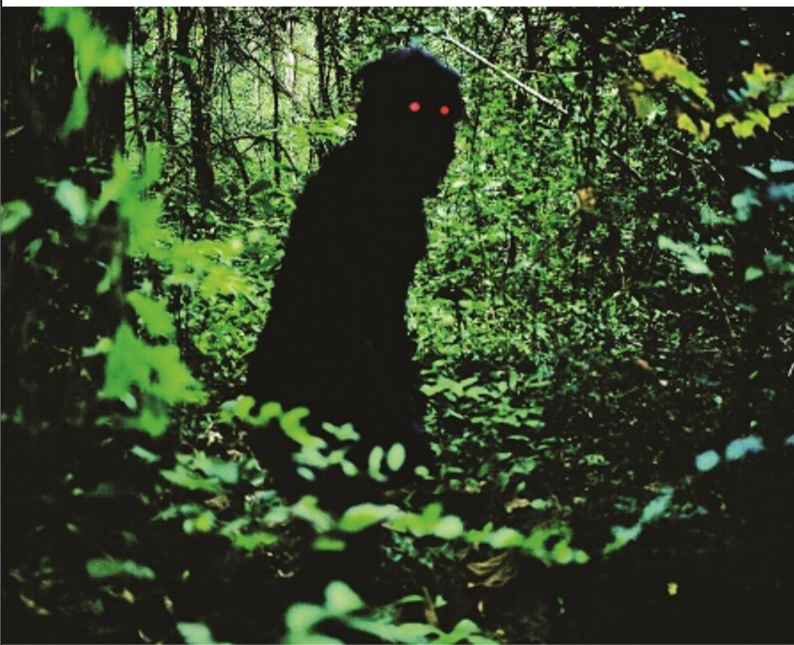
Uncle Boonmee Who Can Recall His Past Lives

“Black Swan” is sold out but we'd be remiss if we ignored it completely.