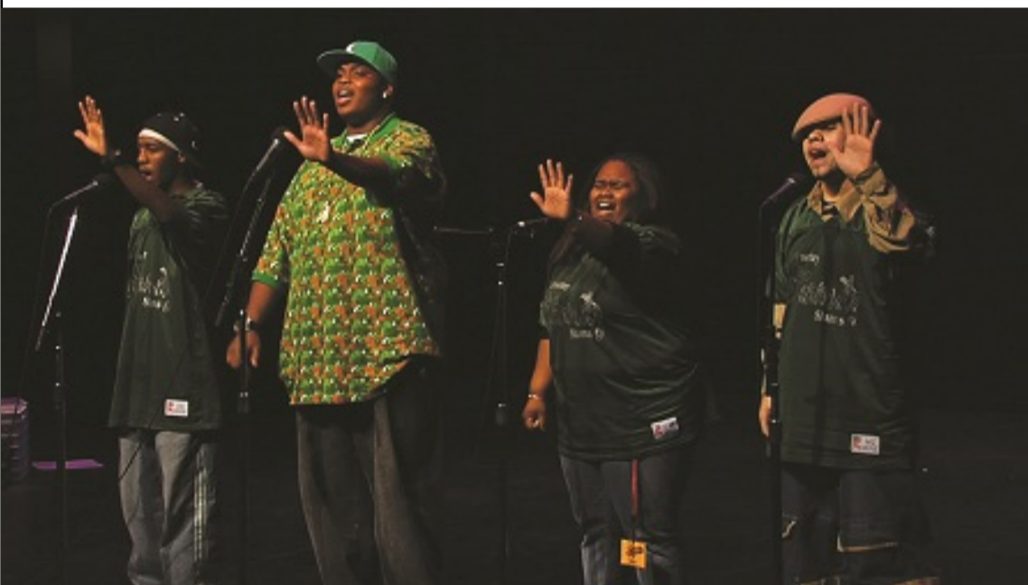
Louder Than a Bomb

The top tier of film’s this weekend includes “Louder Than a Bomb,” “Norman,” “Blame,” “How I Ended This Summer,” “Circus Kids,” and “Waste Land.”