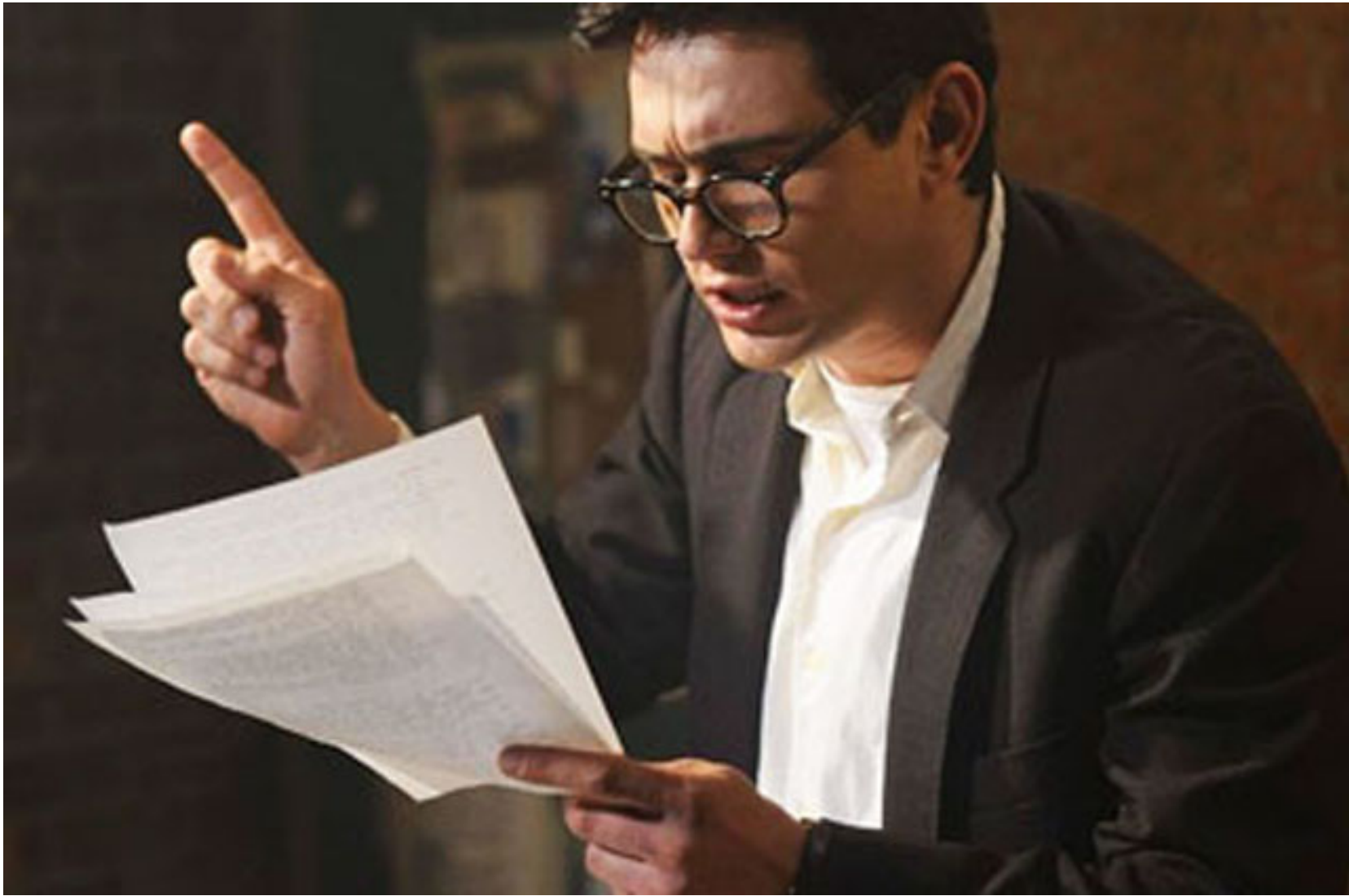
Let Me Tell You Howl it Should Be: James Franco as Allen Ginsberg in 'Howl'