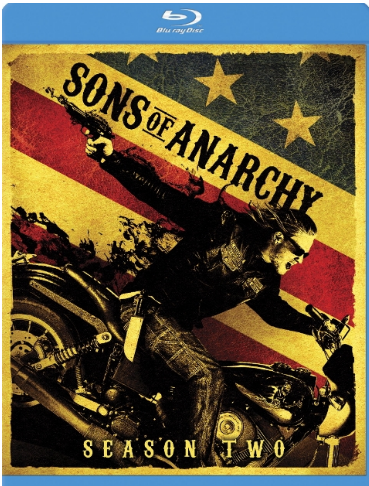
Sons of Anarchy: Season Two