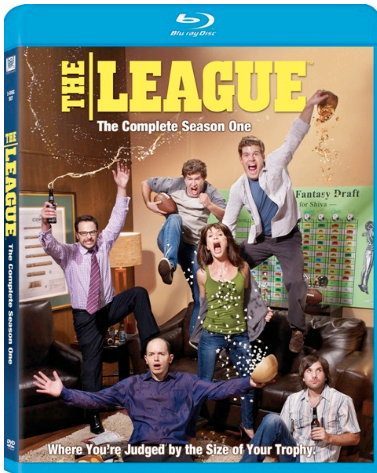
The League: Season One