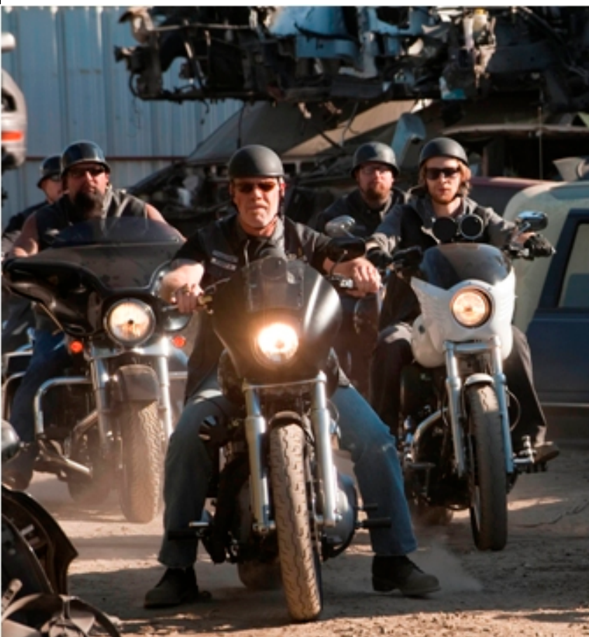
Sons of Anarchy: Season Two

Showtime, HBO, USA, and AMC get more press, but FX has been a consistently essential part of the television landscape for the last decade. Whether it’s the remarkable drama of “The Shield,” the guilty pleasure of “Nip/Tuck,” or the dramatic rollercoaster of “Rescue Me,” they’ve helped redefine drama on basic cable. Their dramatic trajectory has continued with the excellent “Justified,” the recently-debuted “Terriers,” and what could arguably be deemed their most popular show right now, the nearly-Shakespearian “Sons of Anarchy.”